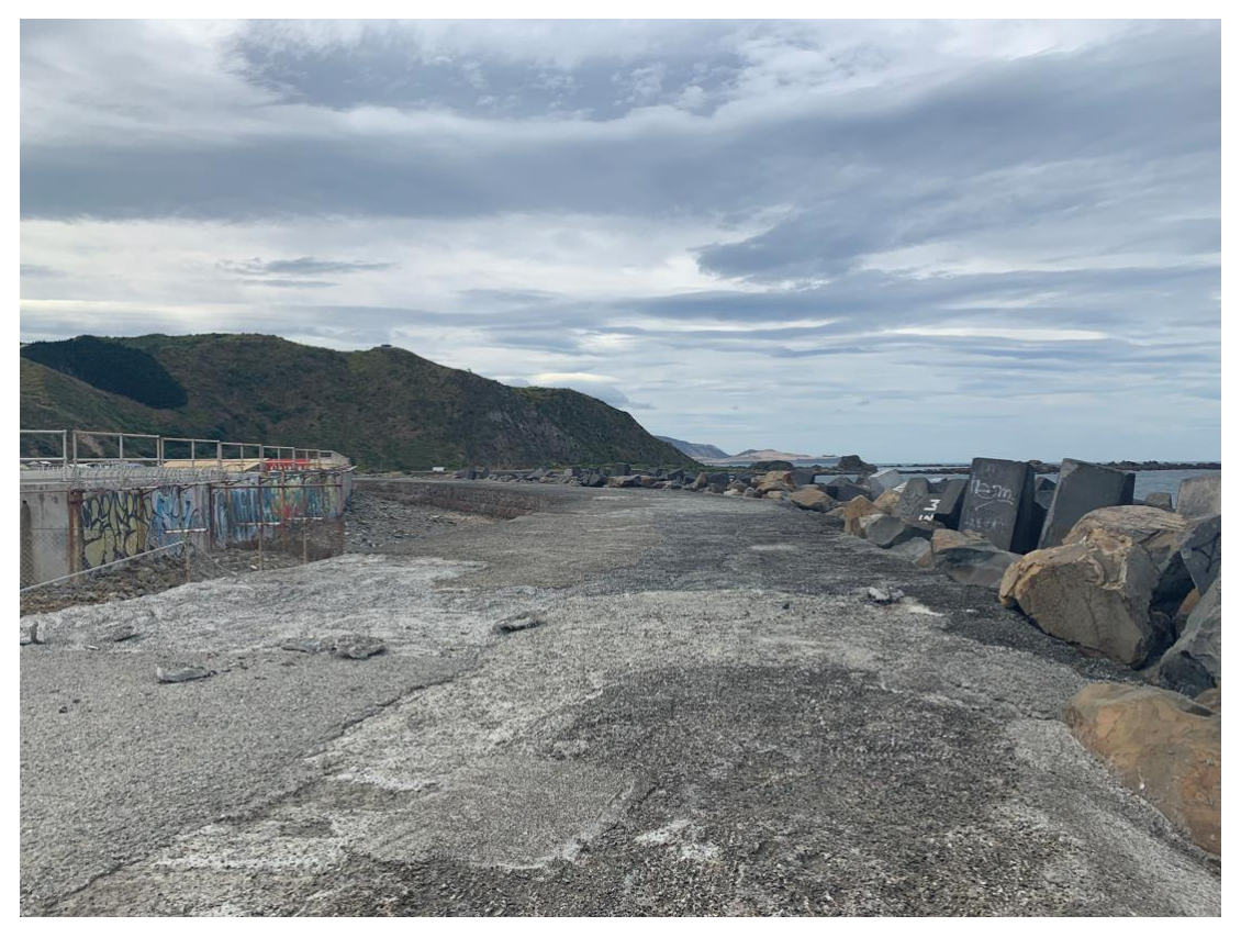
Photo 2: "Crest, gabion basket wall and wave trap between the airport and the southern seawall (looking towards Moa Point)