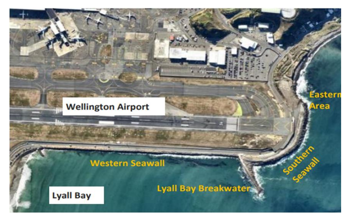
Figure 2: Seawall Structures Lyall Bay

3.5 Currently the seawalls are comprised of three main structures, specifically the southern seawall including a wave trap constructed in 1972, the Lyall Bay breakwater (built in 1954-1955), and the western seawall (built in 1955-56 and modified between 1983 and 1987). See figure 2 below: