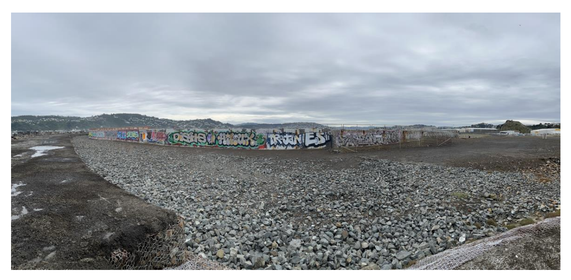
Photo 3: Wave trap and gabion basket wall - looking from Moa Point end of Southern Seawall towards the west.