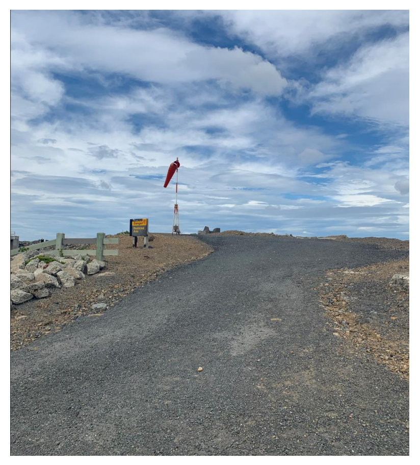
Photo 4: Area Western Seawall and wind sock adjacent to the Lyall Bay Breakwater.