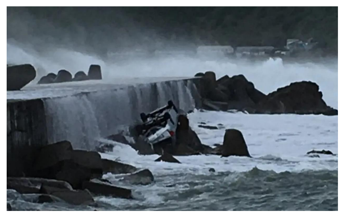
Photo 1 - 2018: A car parked on Lyall Bay breakwater pushed into sea by a wave

5.1 The seawall area requires regular maintenance to address storm damage and agerelated deterioration (e.g. placing additional akmons, re-grading wave trap, gabion basket re-wiring and re-filling; cavity filling in the unpaved crest areas, etc). The wave trap, crest, eastern crest (and access track leading from Moa Point Road) also provide maintenance access and space for emergency akmon replacement storage.