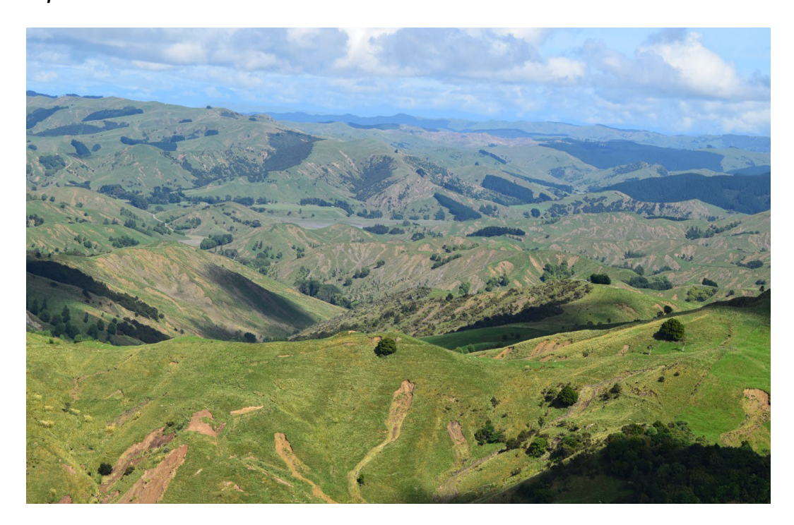
Image 1: Photo of cyclone damage, taken during catchment scheme flight over Manawaannedale.