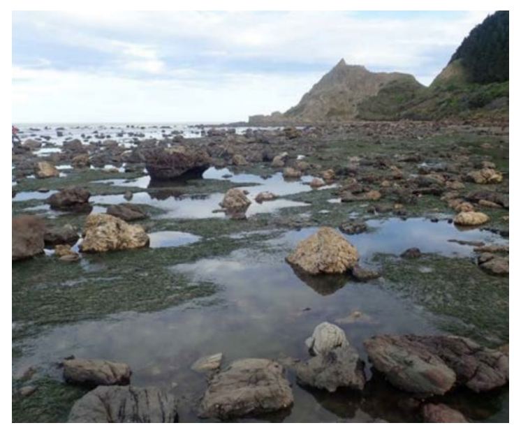
Seagrass south of Mātaikona River