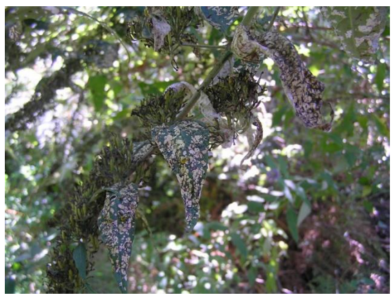
Buddleia showing damage from the buddleia leaf weevil

Monitor agents until it is determined that a given agent has successfully established and is self-spreading or has failed to establish.