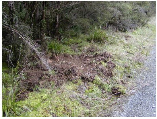
Pig rooting at Wainuiomata Mainland Island

Control Argentine ants at Queen Elizabeth Park and Kāpiti Boating Club.