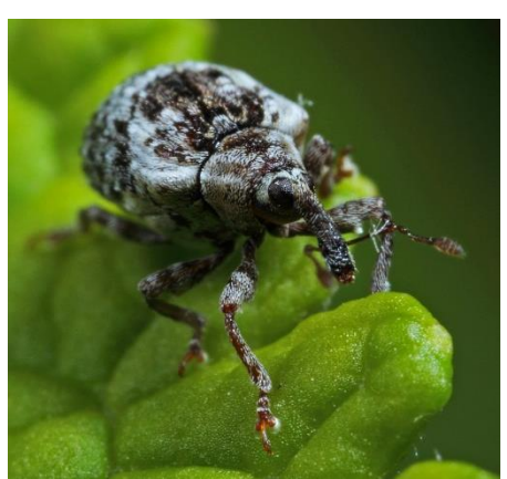
Buddleia leaf weevil