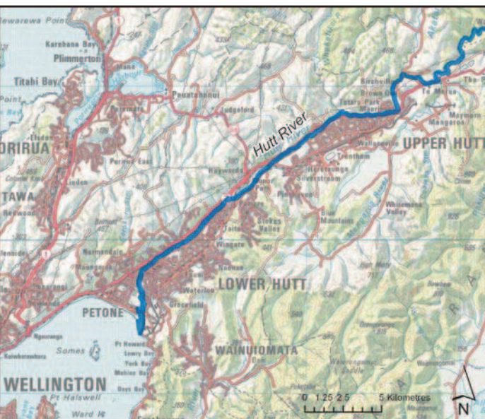
Figure 1: Location of the Hutt River (in blue)

The catchment covers 655 km<sup>2</sup> (that's more than seven times the area of Wellington Harbour!) and contains not only the Hutt River but also the Akatarawa, Pakuratahi, Mangaroa, and Whakatiki Rivers. All of these rivers feed into the Hutt River, so a storm in any part of the catchment could result in flooding