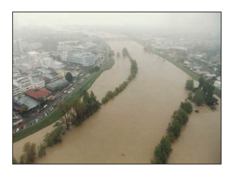
Figure 2: The Hutt River – Central Business District, October 1998