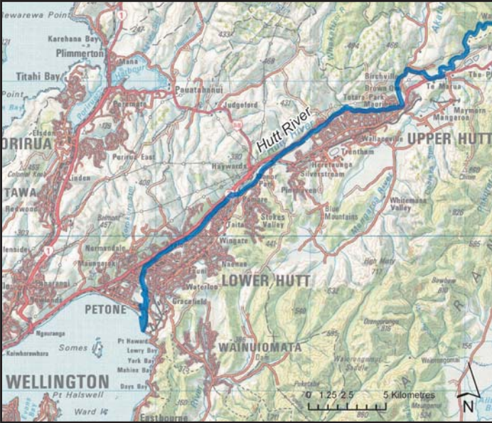
Figure 1: Location of the Hutt River (in blue)

The catchment covers 655 km<sup>2</sup> (that's more than seven times the area of Wellington Harbour!) and contains not only the Hutt River but also the Akatarawa, Pakuratahi, Mangaroa, and Whakatiki Rivers. All of these rivers feed into the Hutt River, so a storm in any part of the catchment could result in flooding.