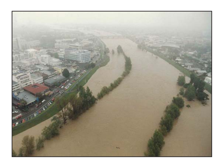
Figure 2: The Hutt River – Central Business District, October 1998