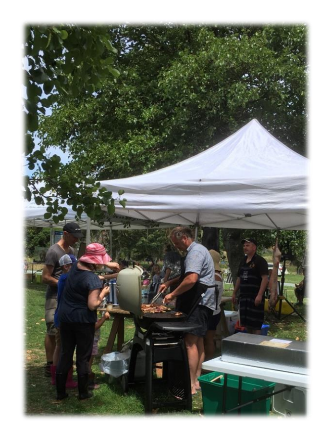
Battle Hill Farm Forest Park – Farm Day event