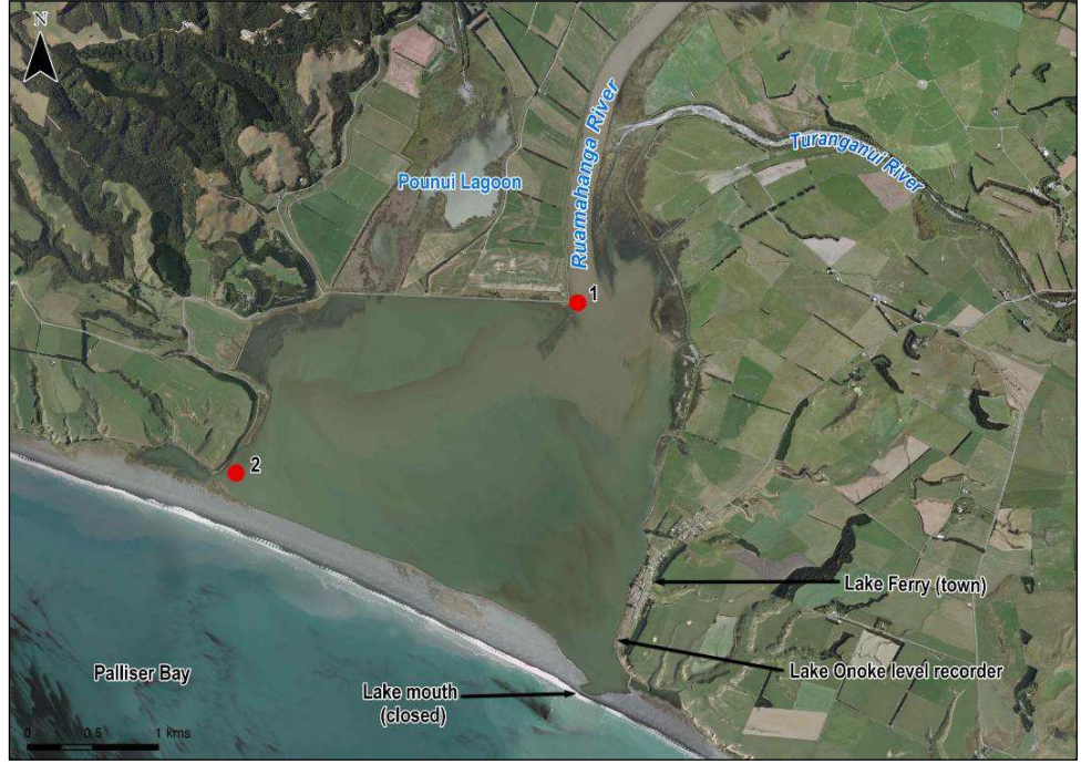
Figure 2: Location of GWRC water quality monitoring locations in Lake Onoke

Biological sampling is not currently routinely undertaken in Lake Onoke, although phytoplankton samples were collected from both monitoring sites on two occasions to identify phytoplankton species and estimate relative species abundance.