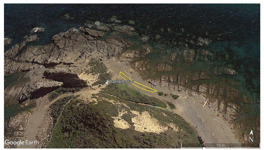
Leptinella nana (Threat Status - Nationally Critical)

Many of the plants at Kaitawa Point on the scar have been wrecked by people using the large driftwood as sunshades. The driftwood has been replaced twice this year to prevent trampling and motorbikes running over the plants. The plans on the coastal edge are doing very well and will be added to again this year.