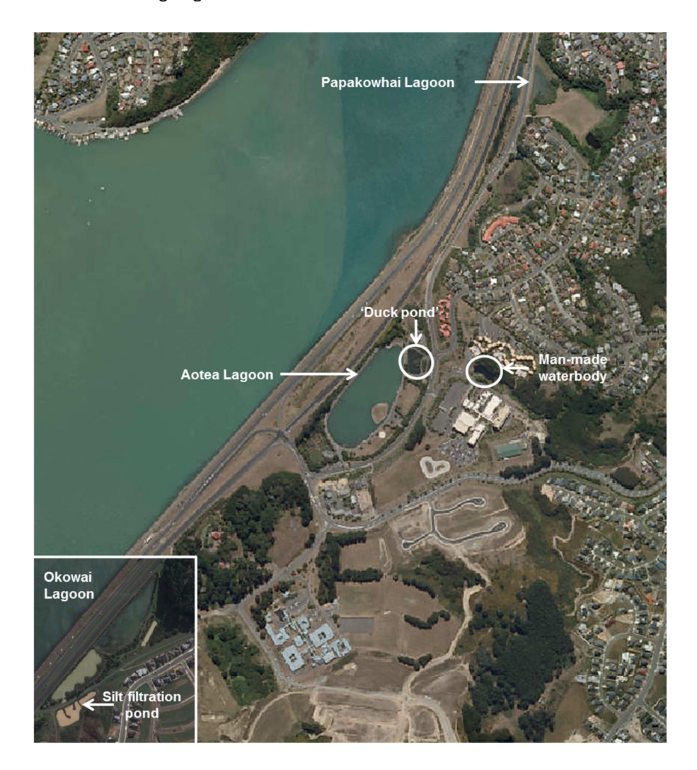
Figure 2: Map showing all three lagoons (Papakowhai, Aotea [including the 'duck pond'] and Okowai), the man-made waterbody in the NZ Police College grounds, the freshwater wetland and the silt filtration pond (built as mitigation for sediment loss as part of the development of Aotea) at the southern end of Okowai Lagoon.

Okowai Lagoon (~2.08 ha) is another artificially-created lagoon located east of SH1 north of the Porirua City Centre and was also the result of the same causeway construction above. Motorway extension saw the lagoon split into two sections, with the southern section acting as a defacto freshwater sediment pond, feeding into the tidal northern section. However, a lack of tidal flushing combined with ongoing earthworks and land development has caused several problems such as ongoing reduced water quality, litter accumulations, seasonal algal blooms with associated odour issues. GWRC, PCC and Carrus Corporation recently (2010) re-profiled the southern section of the lagoon into a wetland more suitable for waterfowl. Adjacent to and connected by a culvert is a large best-practice, three-phase, sediment pond used to filter land runoff from the ongoing earthworks on the Aotea Block.