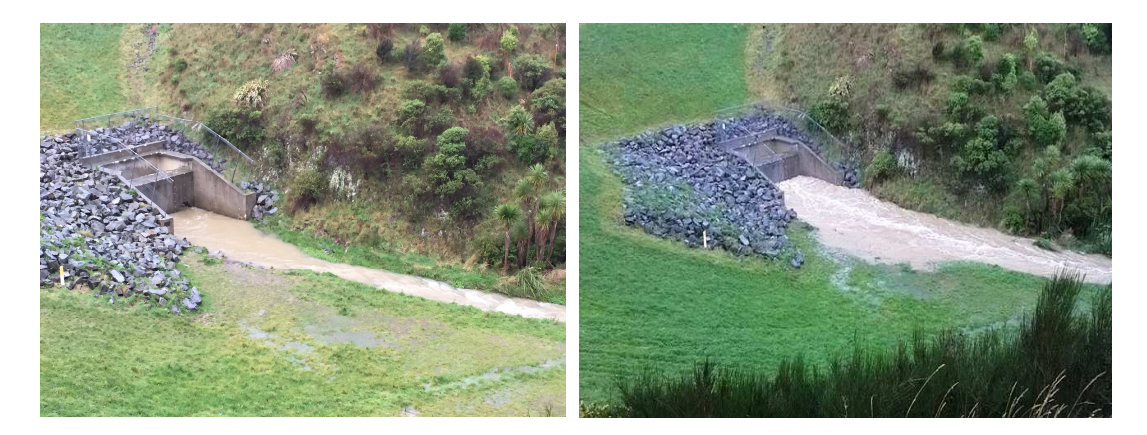
Figure 6: Stebbings Stream flood detention dam at Churton showing the energy dissipation structure at the outlet prior flooding and after flooding in May 2015.