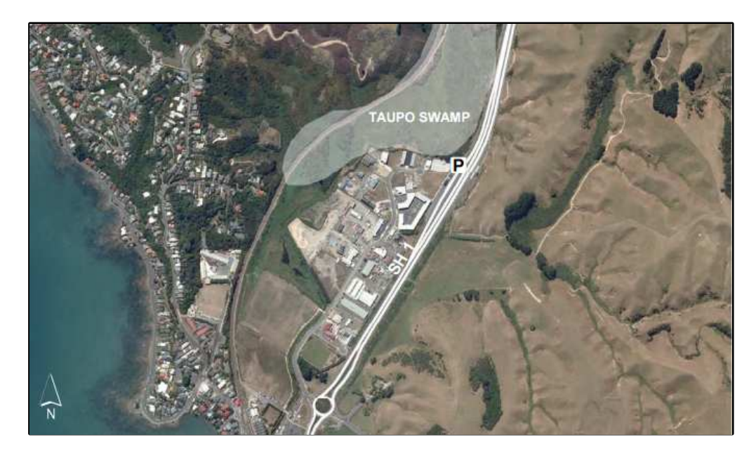
Figure 3: Map showing area of Taupo Swamp off SH1 in Te Awarua-o-Porirua Whaitua.

The completion of Transmission Gully Motorway is likely to see a significant reduction in road traffic using the current SH1 adjacent to the Swamp and stream.