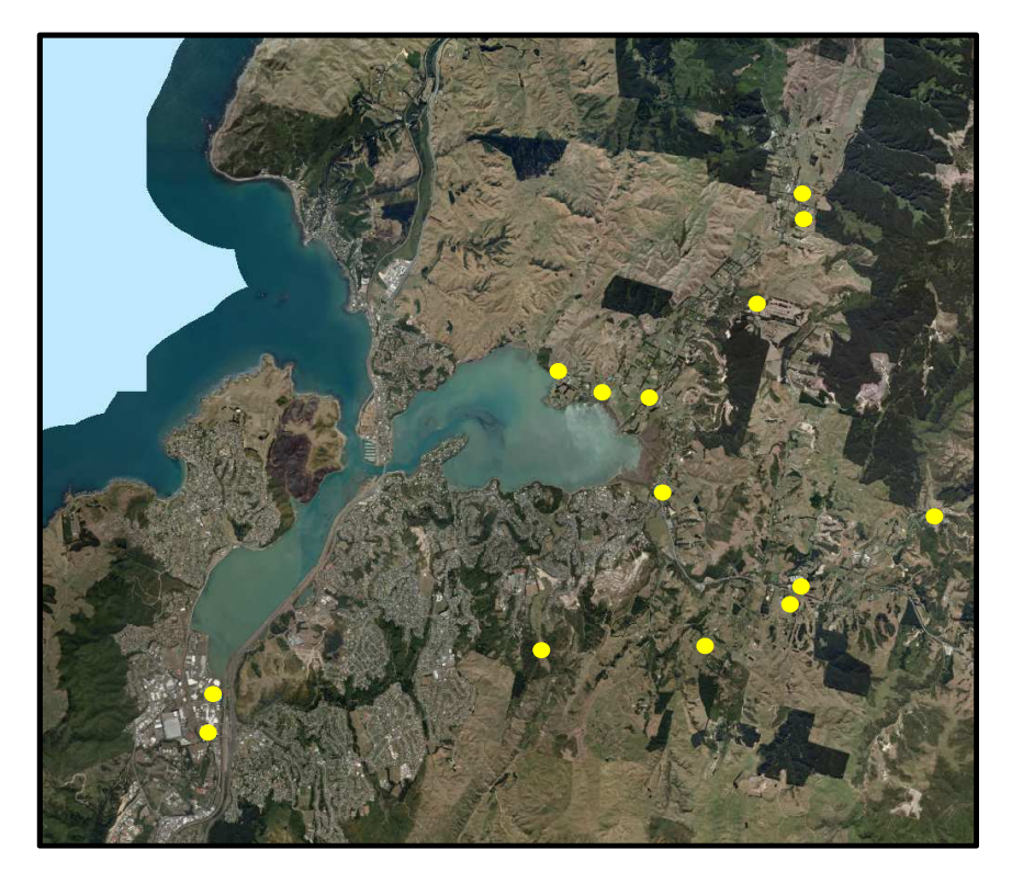
Figure 5: Map showing location of known bores and wells (yellow dots) in Te Awarua-o-Porirua Whaitua.

It should be noted that groundwater and surface-water bodies (streams, lakes, wetlands, and estuaries) interact in many ways. For example, wetlands may gain water from groundwater systems while water take from streams may reduce groundwater availability. Contamination of surface-water bodies can cause degradation of ground-water quality and vice versa.