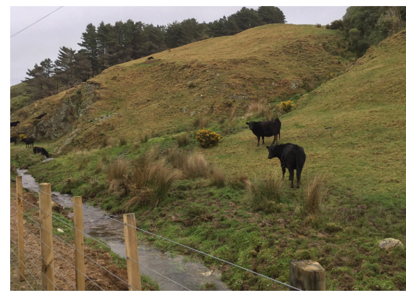
High-impact activities such as grazing will always require an AEE and may not be permitted if they are incompatible with park values or if remedy of effects cannot be achieved

High-impact, low-benefit activities are less likely to be appropriate in parks and see more activity conditions applied, if they are permitted.