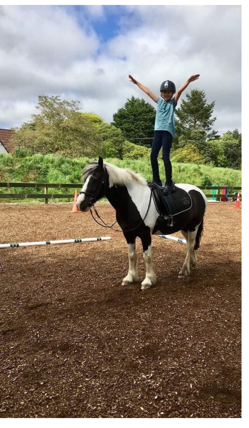
Wellington Riding for Disabled at Battle Hill went through a long and thorough proposal development and AEE process with many people to identify the best site in the park for a large indoor riding arena and associated facilities. This new activity in the park and facilities fit in well and have delivered many benefits for the group, park and community.

The more significant the proposal and the more significant the place or site values, the more thorough the AEE needs to be. That is the scale and nature of the AEE needs to be in proportion to the proposal . For large or sensitive activities we recommend you find an expert to help you prepare your AEE, or use from Greater Wellington supplies. For small-scale activities, you may be able to prepare your own AEE. We recommend you use Greater Wellington's basic template on the website.