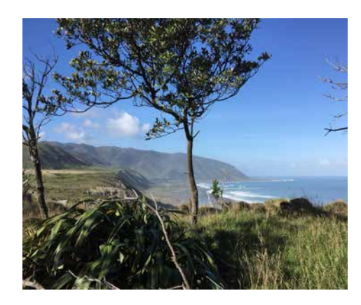
The new loo could have a view like this