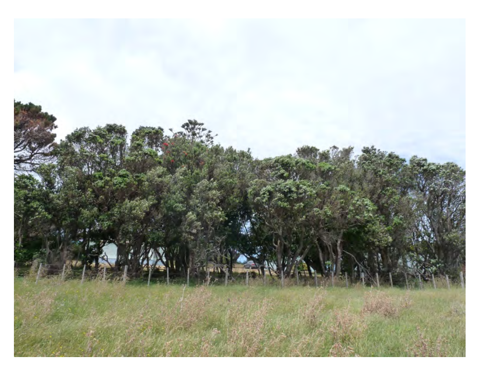
Shelterbelt viewed from outside the compound, noting pohutukawa along the outer edge with macrocarpa and pine contributing the main structural elements