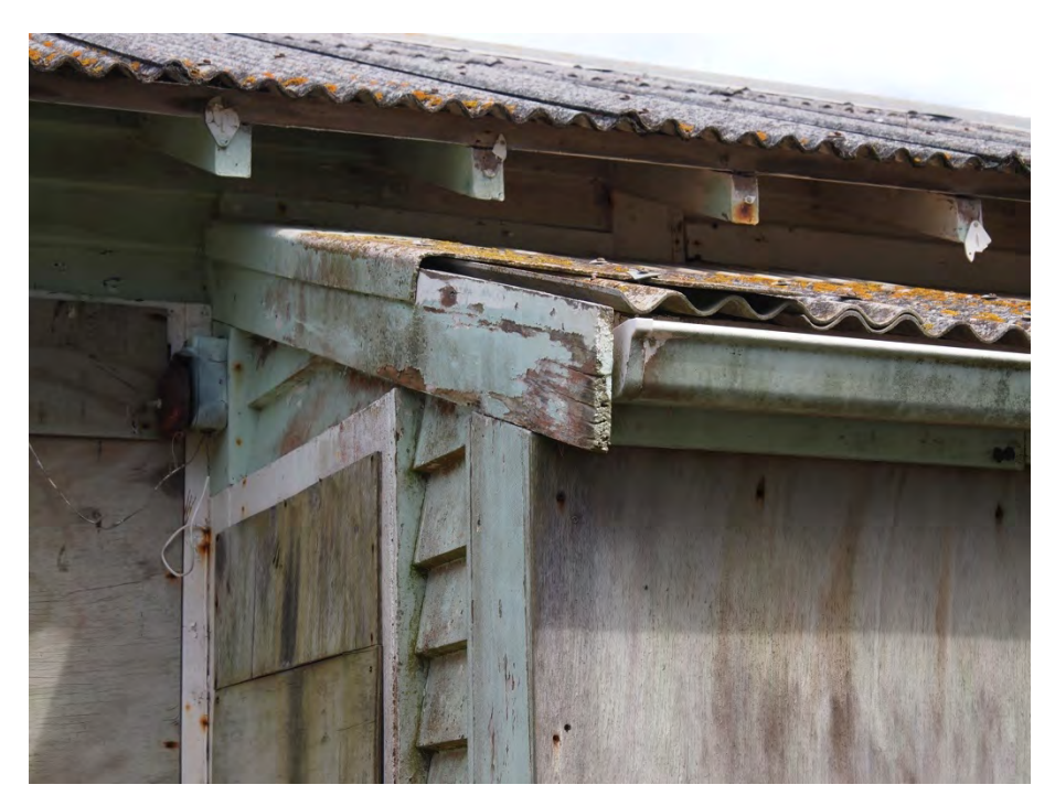
Paint peeling, cracked asbestos roofing, algae growth - typical of all elevations