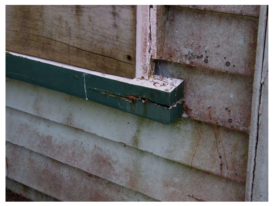
East elevation splitting sill