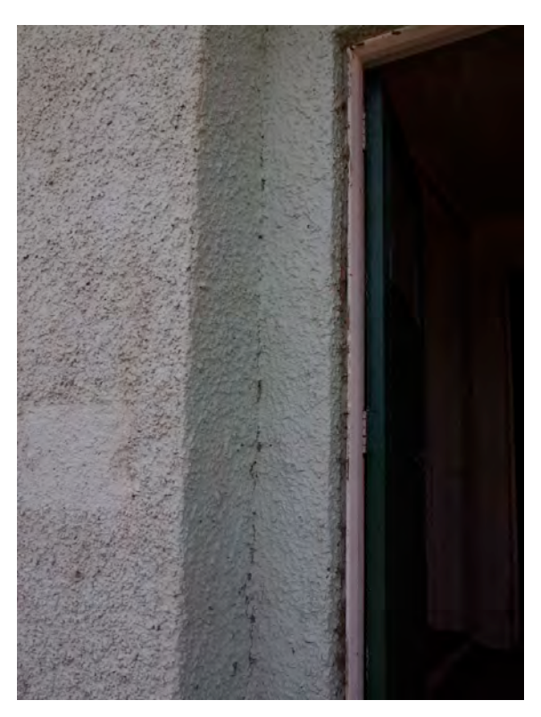
Cracking to corner, west elevation