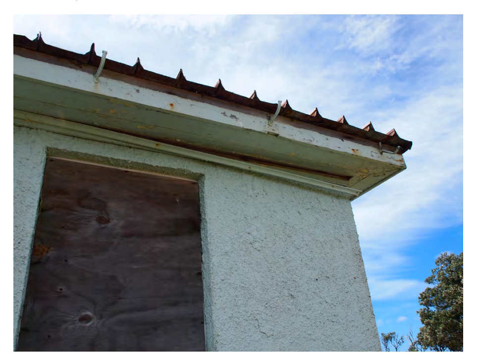
Loose molding, rusting trough section roofing