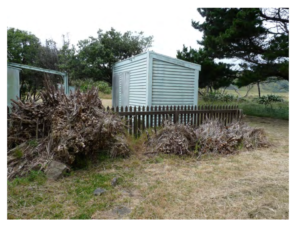
Remnants of the original picket fencing remain in a few places