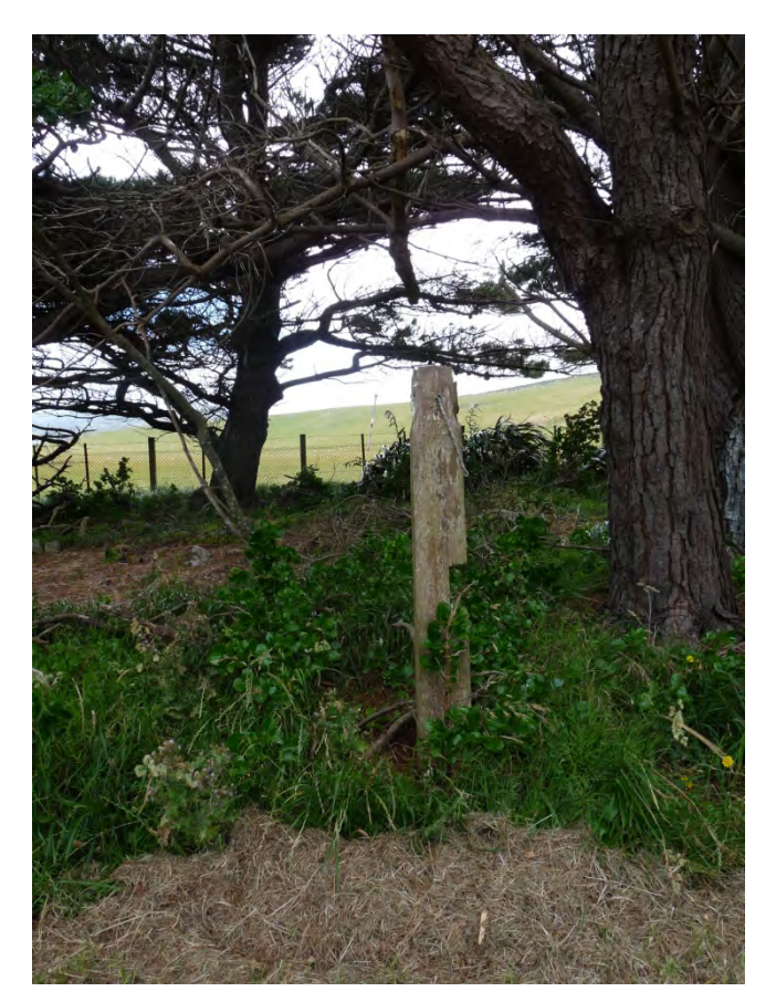
Example of one of the few remaining original fence posts