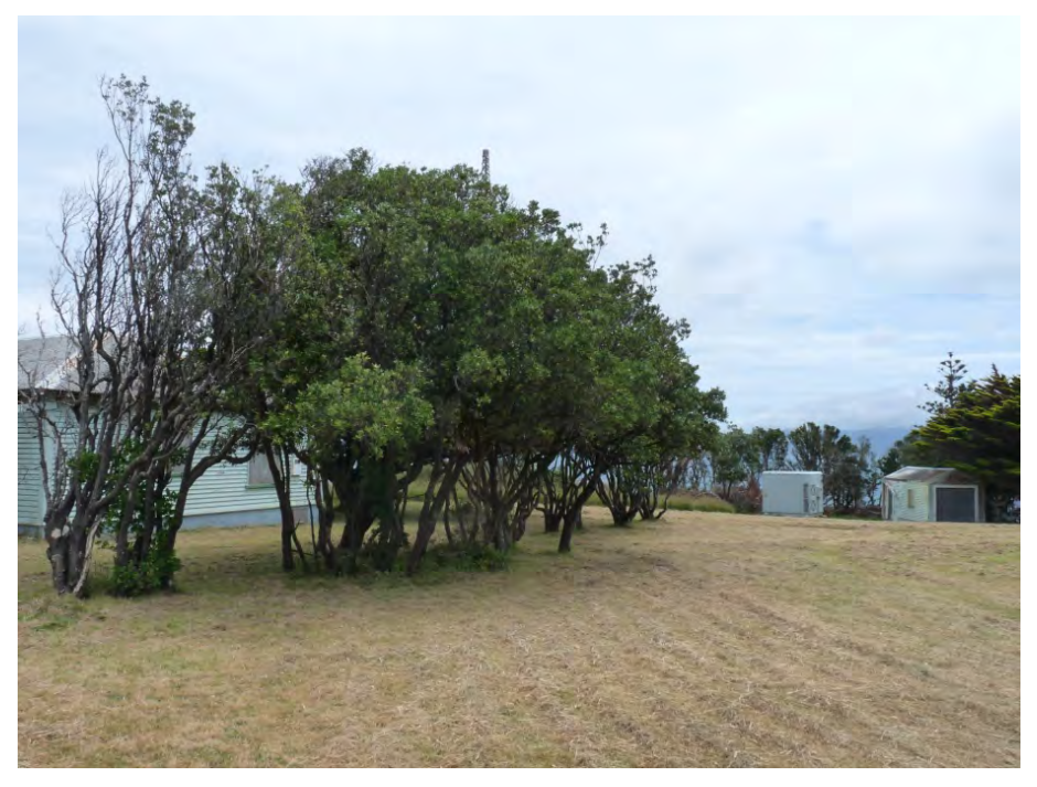
Some tree removal and arboricultural management required for plantings within the compound % \left( \mathbf{r}\right) =\left( \mathbf{r}\right)