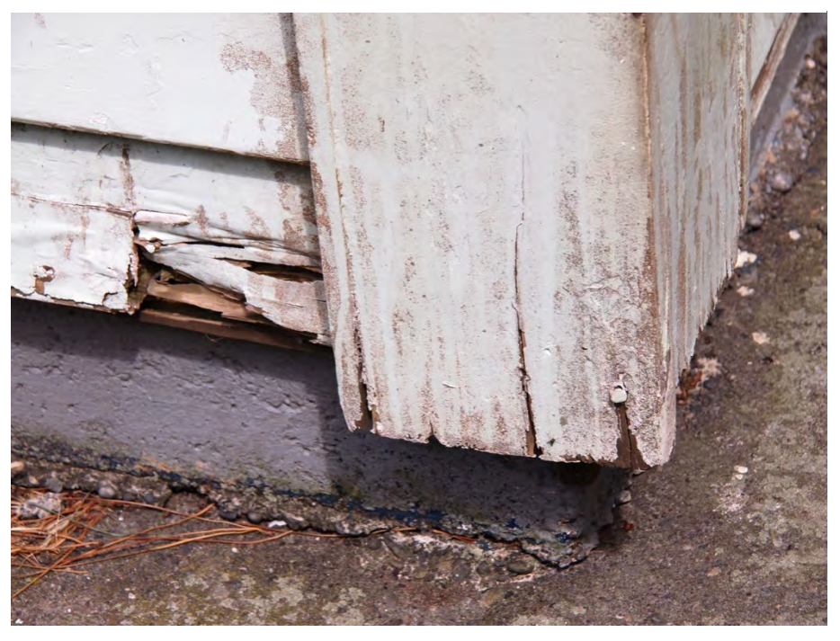
Rot in the north east corner