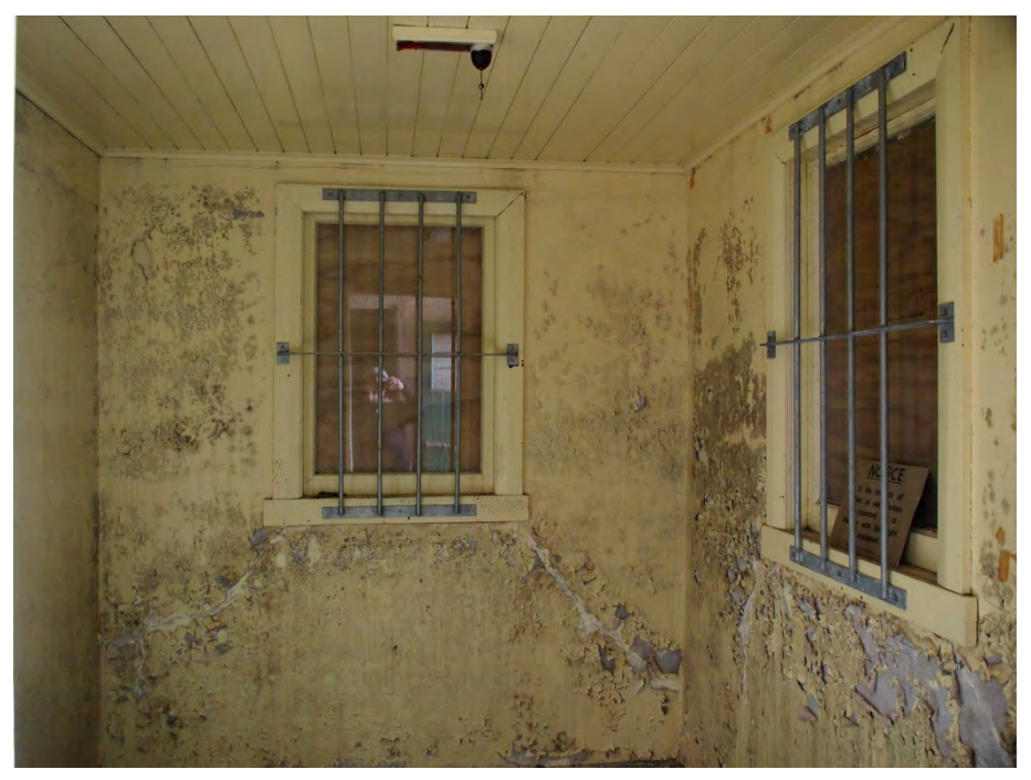
South west corner room, peeling paint and cracked plaster