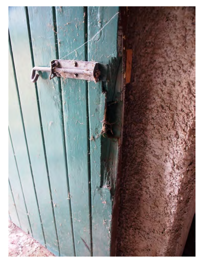
Damaged front door