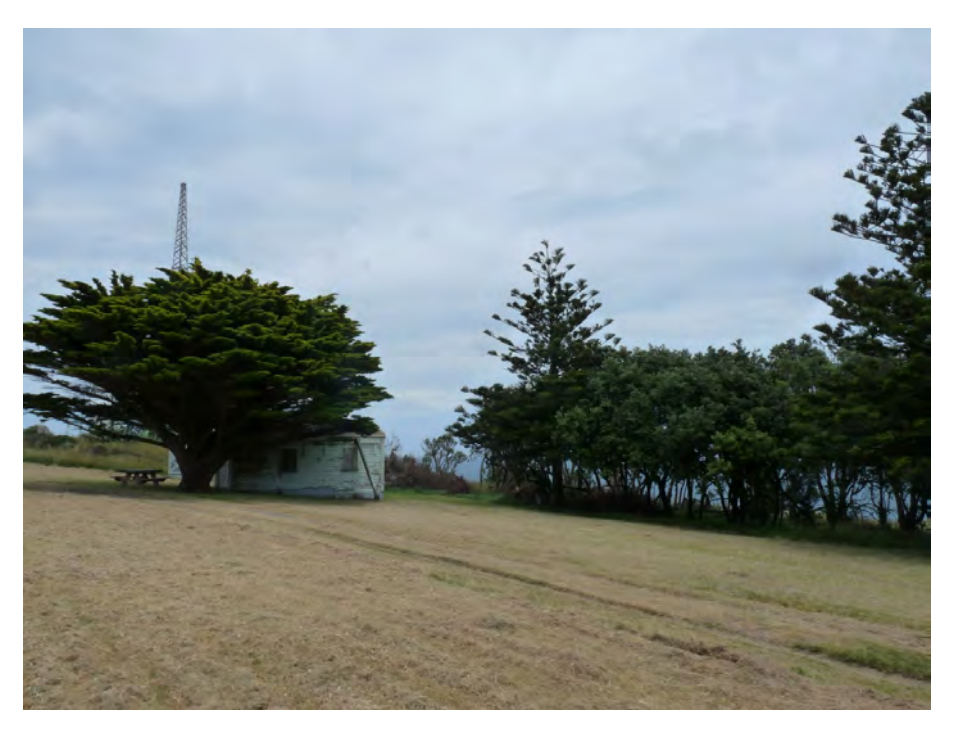
Golden macrocarpa and Norfolk Island pines contribute distinctive landscape elements