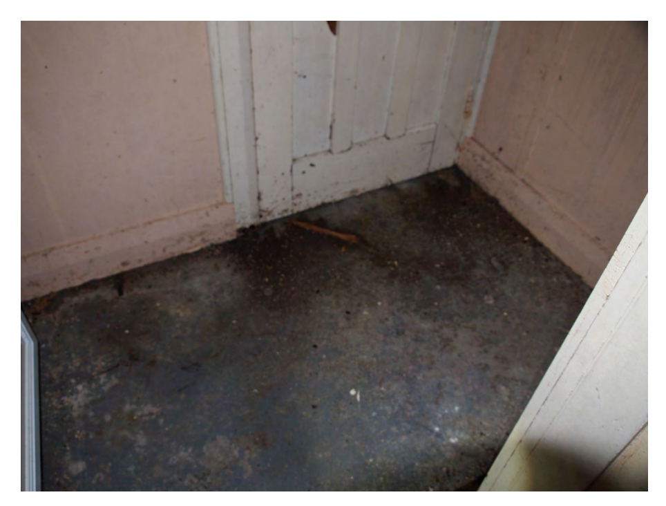
Damaged flooring to kitchen