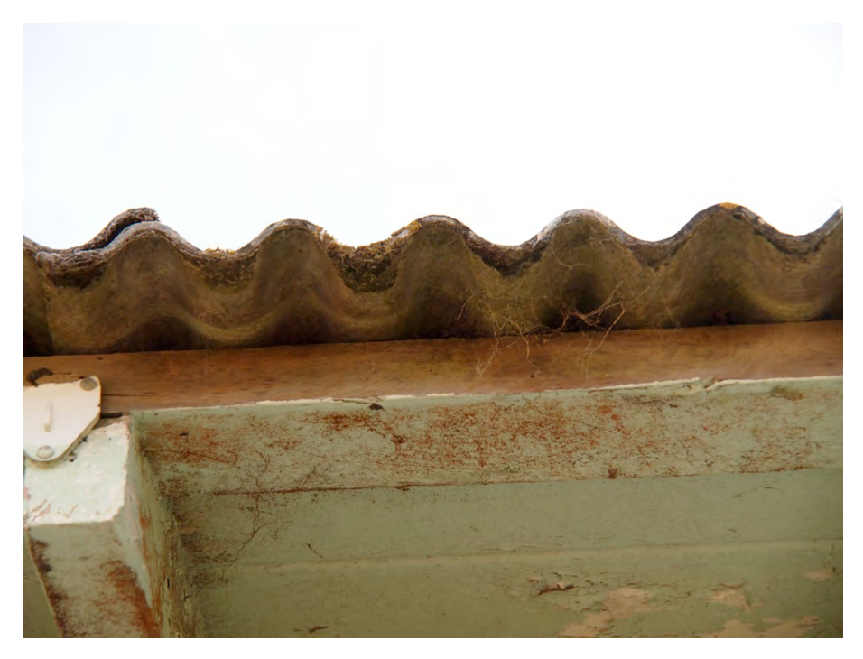
Fraying cut edges to roofing – east elevation