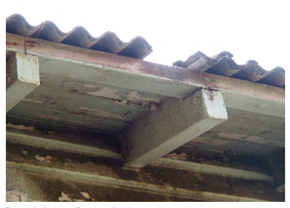
Damaged asbestos roofing - west elevation