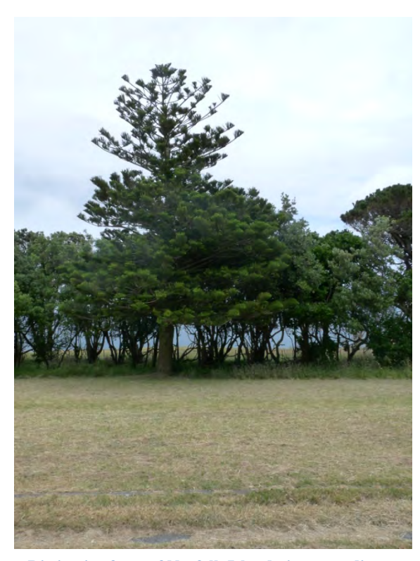
Distinctive form of Norfolk Island pine extending above shelterbelt