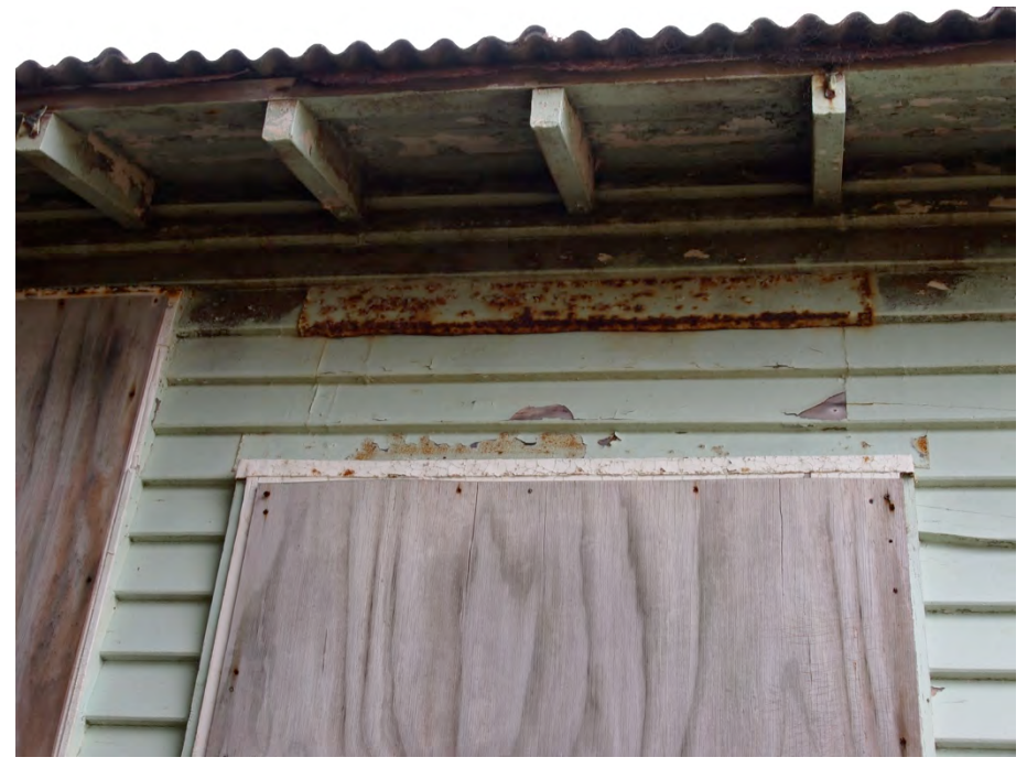
Rusting head flashings, peeling paint, missing guttering – typical of all elevations