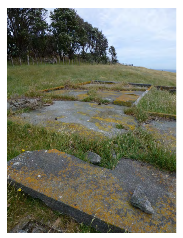
Lichen and mold on concrete foundation