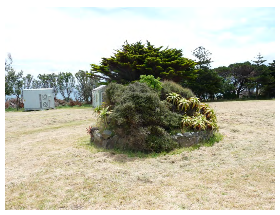
Rock garden remains largely intact, requiring only minor maintenance