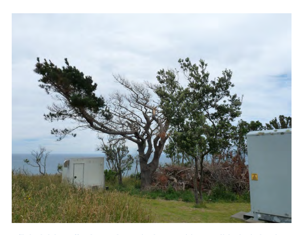
Shelter belt\ has\ suffered\ storm\ damage\ in\ places\ requiring\ remedial\ arboricultural\ attention