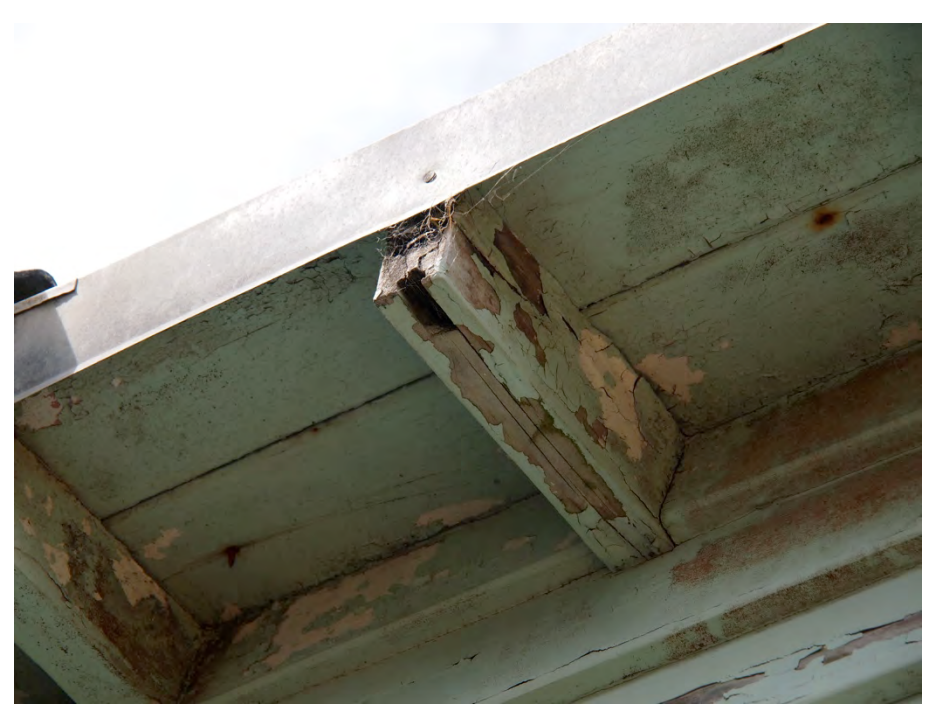
Rotten rafter end, rusting nails, peeling paintwork – west elevation