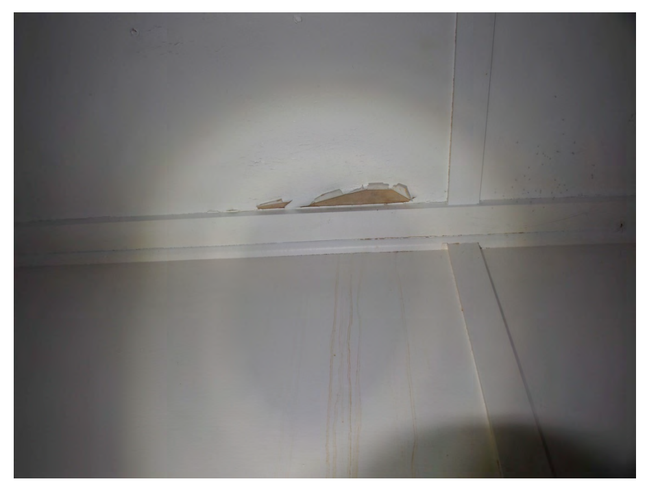
Peeling paint, dining room