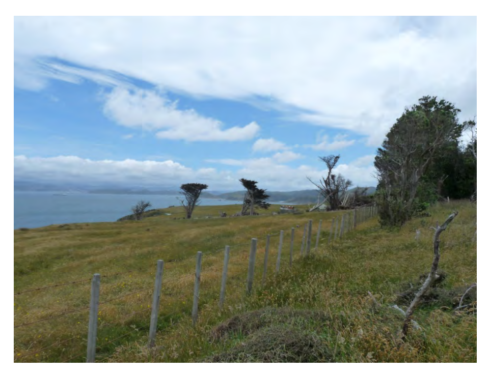
Only a few straggly trees that were part of the original shelterbelt between the northwestern boundary and the escarpment remain