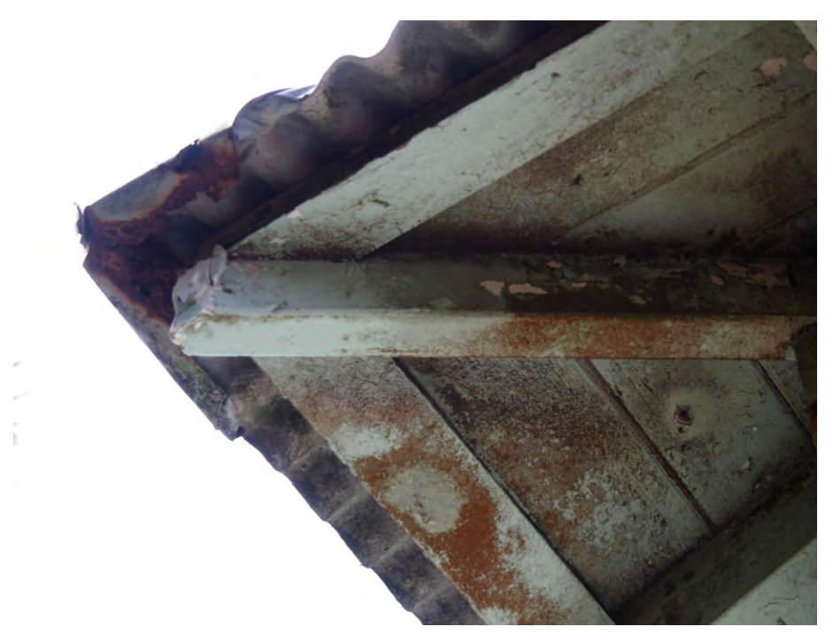
Rusting under side of corrugated steel ridge flashing – west elevation