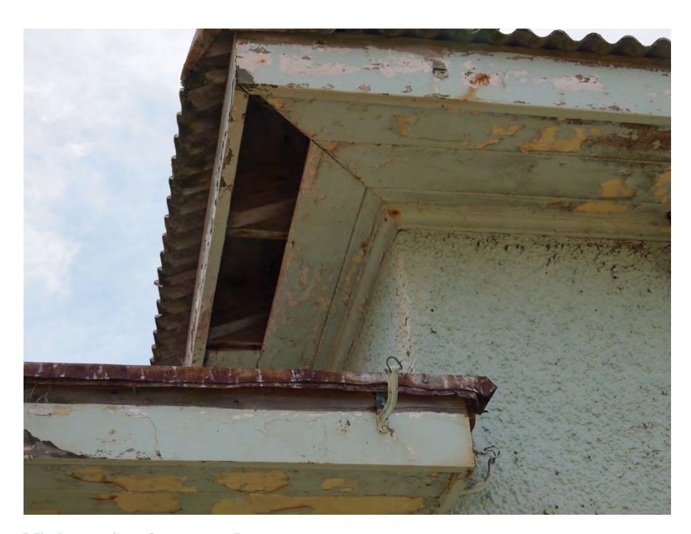
Missing section of eaves, south west corner