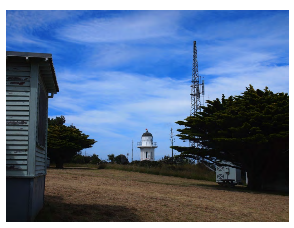
Condition and Remedial Action Report

Baring Head Lighthouse Compound February 2014