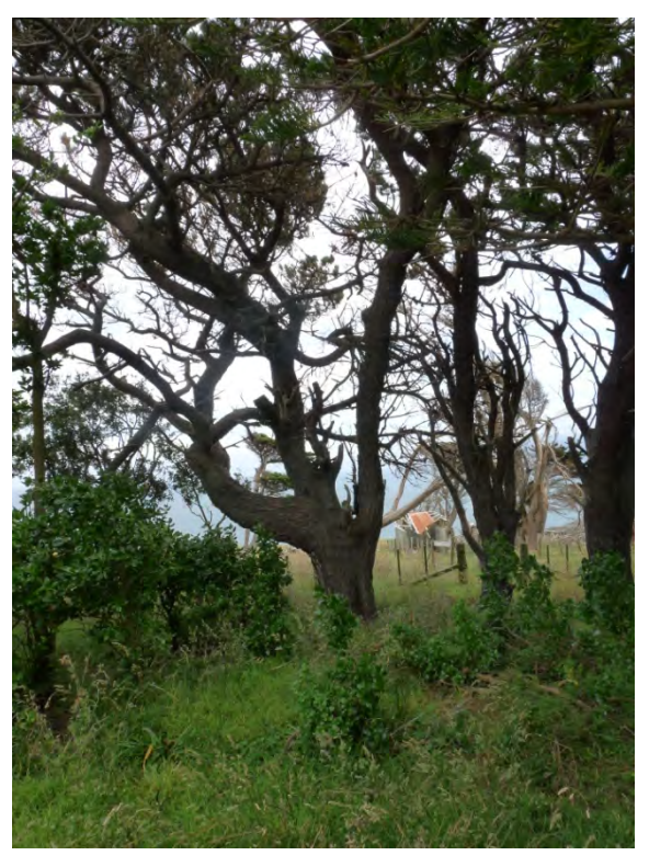
Shelterbelt would benefit from remedial work to improve longevity