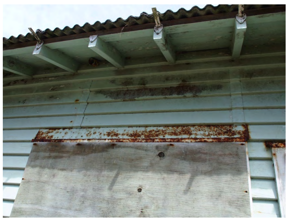
Rusting head flashings, missing guttering, fraying corrugated as bestos roofing edging – east elevation \,