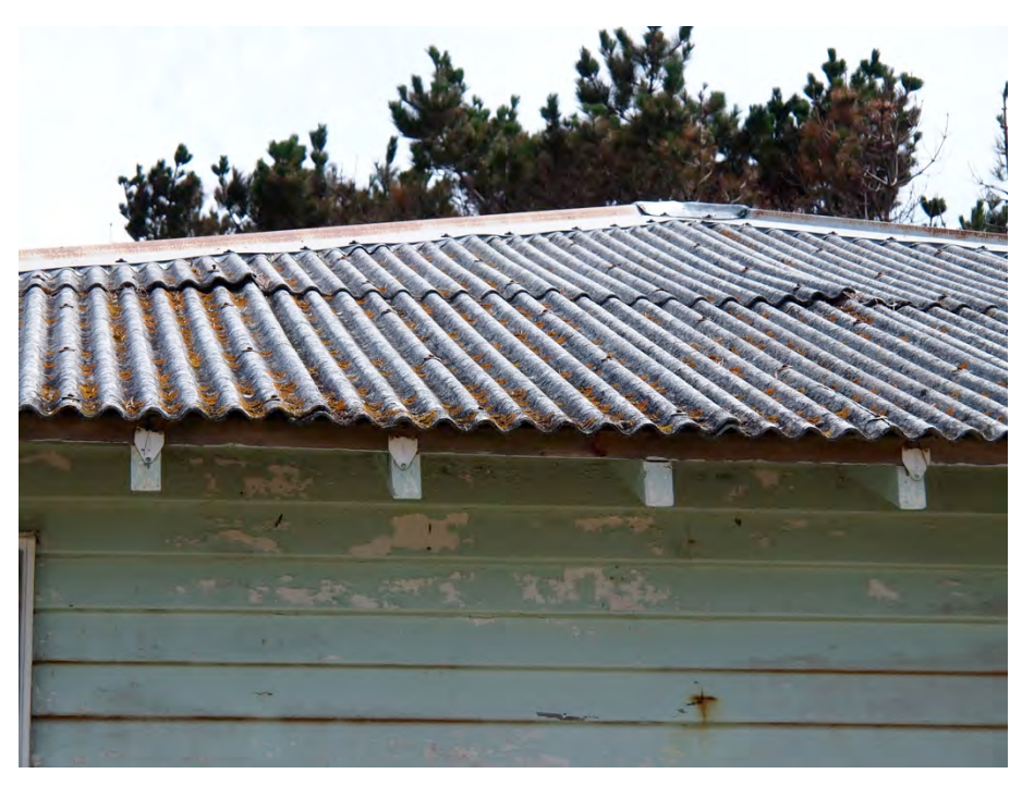
Lifting asbestos roofing – east elevation