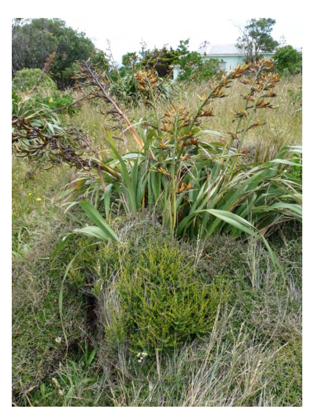
Local native vegetation has established, particularly along the south-east boundary of the compound