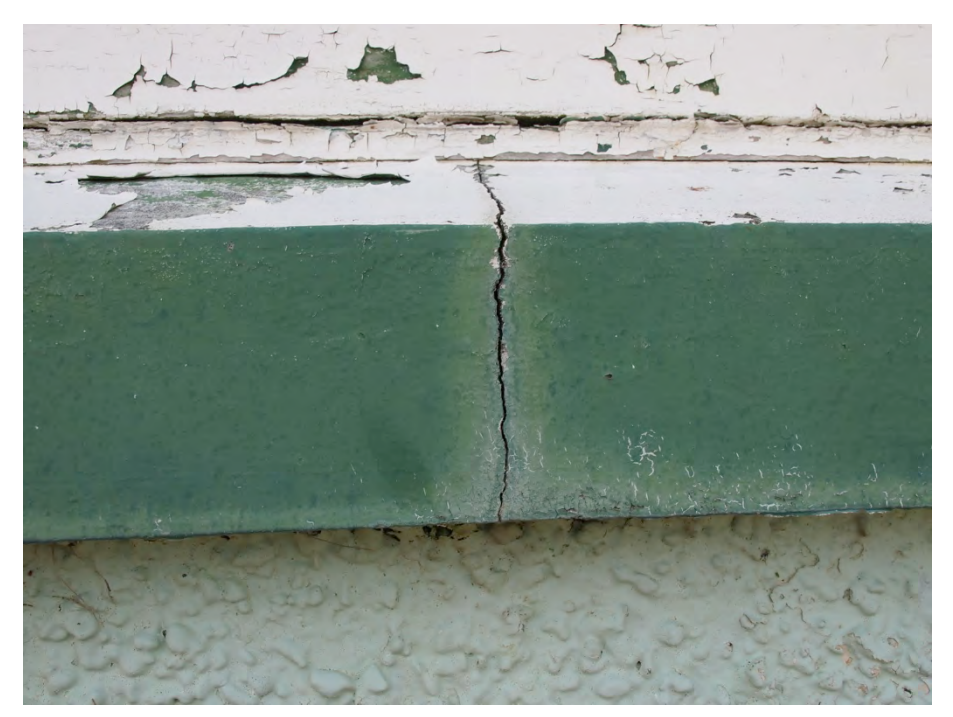
Cracked sill, west elevation