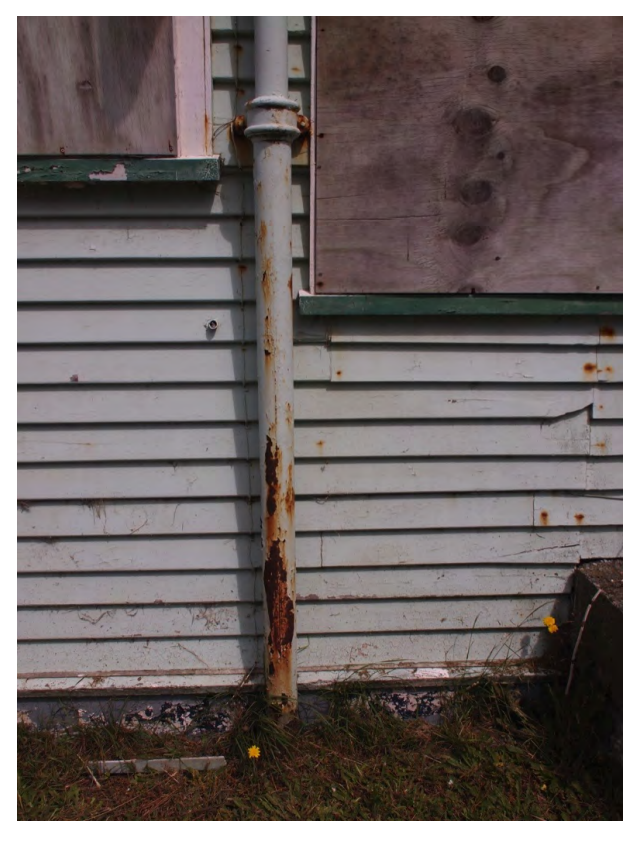
Rusting vent pipe, rusting nails and split and damaged weatherboards – east elevation