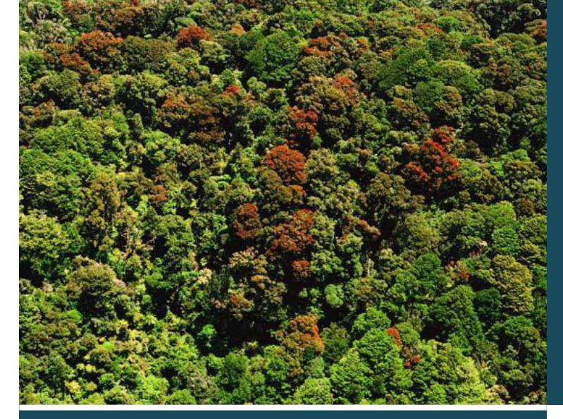
Rata trees in flower

Rat invading a bird nest