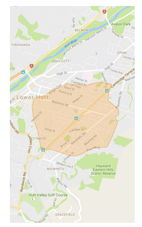
Google Maps example