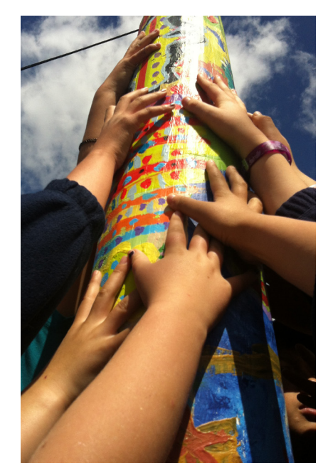
Masterton Primary School Walking Pou