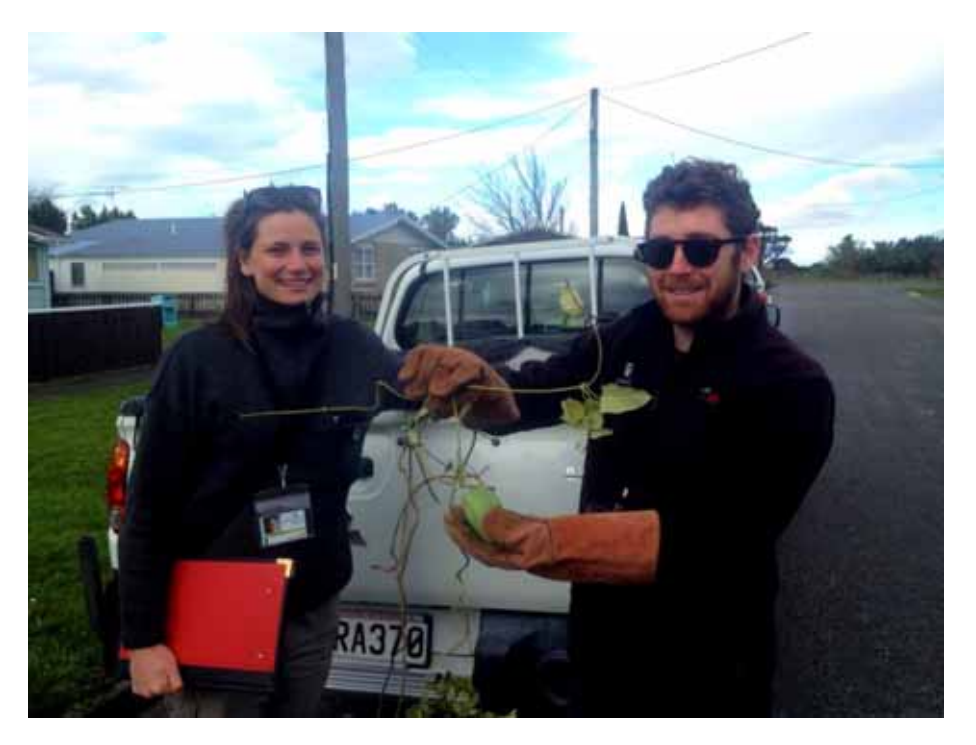
Biosecurity staff with a mothplant pod found at an urban Featherston property. Gloves are required as protection against the toxic sap of the plant.