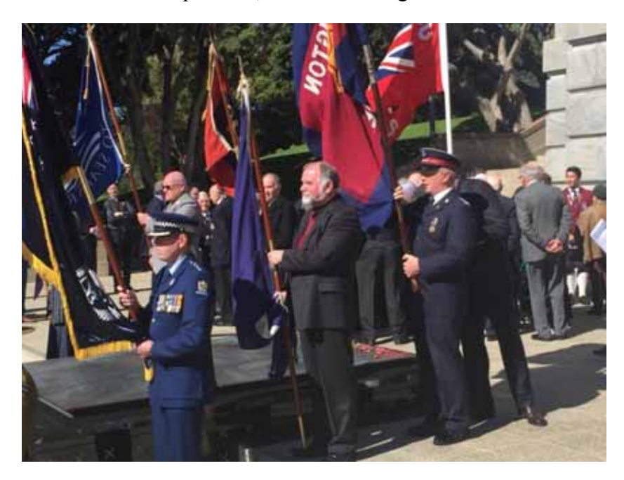
Some Beacon Hill staff as flag-bearers at Merchant Navy Day.

World Maritime Day saw Maritime New Zealand hold a "Maritime Industry National Forum" on 2 September, and Merchant Navy Day commemorations were held on 3 September, both in Wellington.