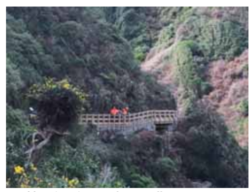
From left: new Coastal Track section; new bridge and barriers in Korokoro Valley

Along a similar theme, the Korokoro track is open again following a temporary closure to repair a track edge collapse. A concrete wall dating back to the construction of the original Korokoro Dam fell away while contractors were preparing the site for a new retaining wall. The site now is stable, with a full width track, a bridge and a new safety barrier. However, the collapse is a good reminder about the risks associated with managing heritage features.