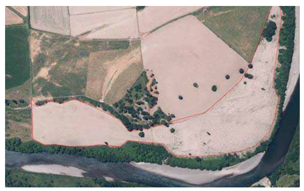
Monitoring site for sequence cropping

In collaboration with a local Martinborough farmer a programme of work on sequence cropping of kale and oats has commenced. Sequence cropping has the potential to achieve a 40% reduction in the percentage of nitrogen leached. This work is being conducted in collaboration with farmers and industry in our region and supports the identification and promotion of Good Management Practice.