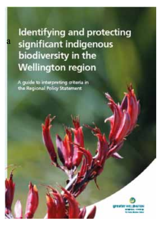
Figure 2. Cover of Identifying and protecting significant indigenous biodiversity in the Wellington region

The guidance document Identifying and protecting significant indigenous biodiversity in the Wellington region (see Figure 2) has been published. This guide clarifies how territorial authorities and resource consent applicants can identify and protect significant biodiversity in line with provisions in the Regional Policy Statement. The guide has been presented to GWRC staff with further presentations scheduled for territorial authorities, the Ecological Institute of Australia and New Zealand, and other groups over the coming months.