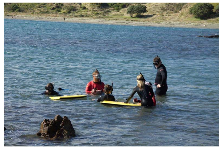
Regulation and Environmental Policy departments.

Biodiversity departments, in active collaboration with the Environmental