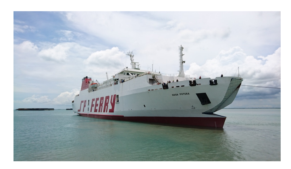
Santa Regina after major refit, renamed Nusa Putera for service in Indonesia.