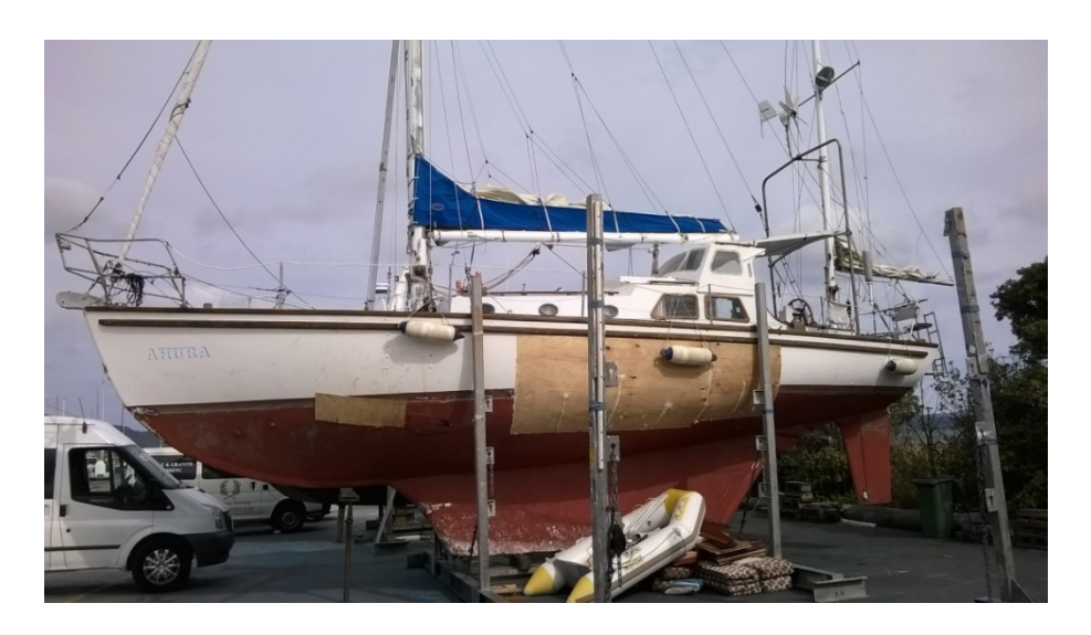
Safely salvaged and at Seaview Marina hardstand.

During the night of 22/23 April, a nine metre wooden yacht broke free from its swing-mooring in Evans Bay during a strong north-westerly and drove ashore on the Evans Bay Marina rock breakwater, with the bow on the rocks and most of the boat submerged. The owner was not insured, did not have finances to arrange salvage operations, and formally abandoned the vessel. Salvage work was organised by Harbours, firstly to tow the yacht away from the rocky breakwater on the evening of 23 April and allow it to sink on a flat seabed to avoid further damage and possible breaking-up in bad weather. On 24 April the sunken yacht was refloated and towed to a boat-lift at Evans Bay, where it was lifted ashore, pending decisions on its future.