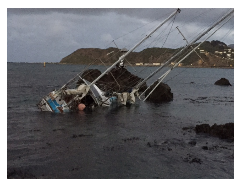
Yacht ashore at Moa Point

On the evening of 4 April a recreational yacht ran aground on rocks at Moa Point, Lyall Bay, Wellington. Salvors appointed by an insurance company refloated the yacht on 6 April and safely towed it into Seaview Marina for repair.