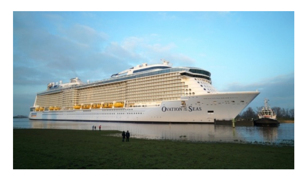
Ovation of the Seas