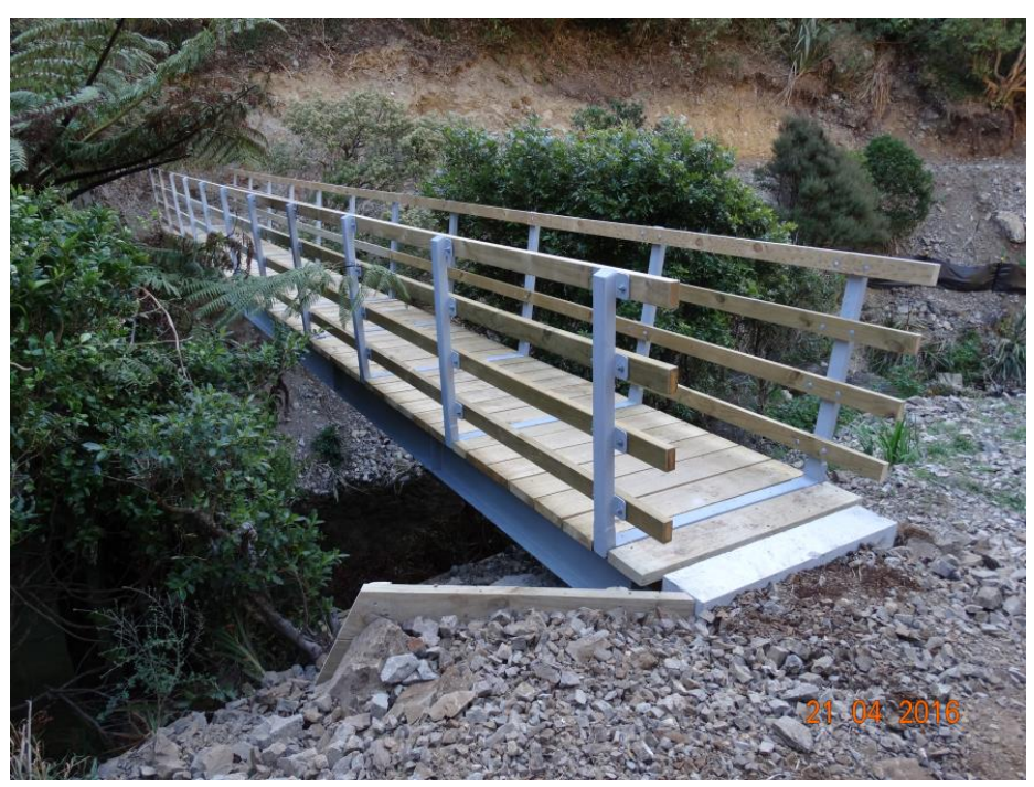
\label{eq:continuous} \mbox{Helicopter installation of the new steel beam bridge at Korokoro (Belmont Regional Park).}