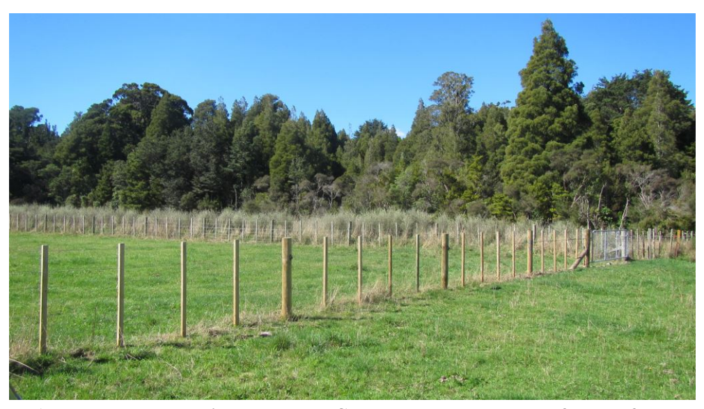
A bush remnant on private land near Carterton that has been put forward for a QEII open space covenant

An area of remnant bush on private land near Carterton has been put forward as a potential QEII open space covenant. GWRC has approved funding for fencing and weed control to protect the biodiversity values of this site, which adjoins existing QEII covenants, Fensham Reserve and the Fensham KNE site. The memorandum of understanding with the QEII National Trust is being reviewed to ensure it describes recent improvements in processes between the two organisations. This complements GWRC's strong and positive working relationship with QEII.