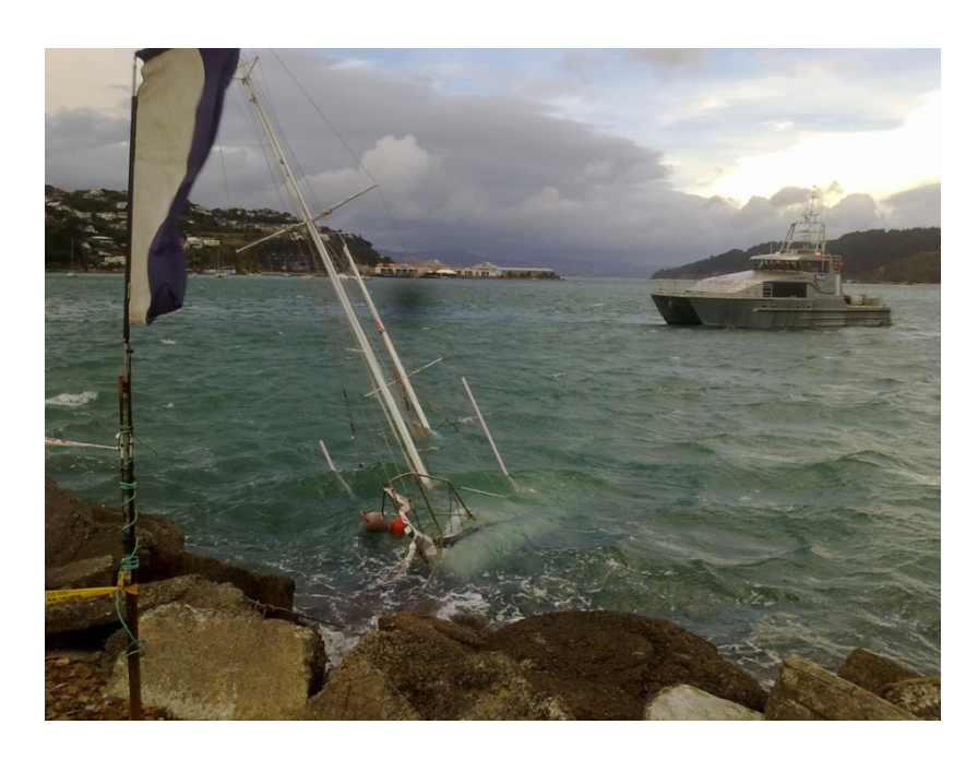
Police launch Lady Elizabeth IV assisting to tow sunken yacht away from breakwater.