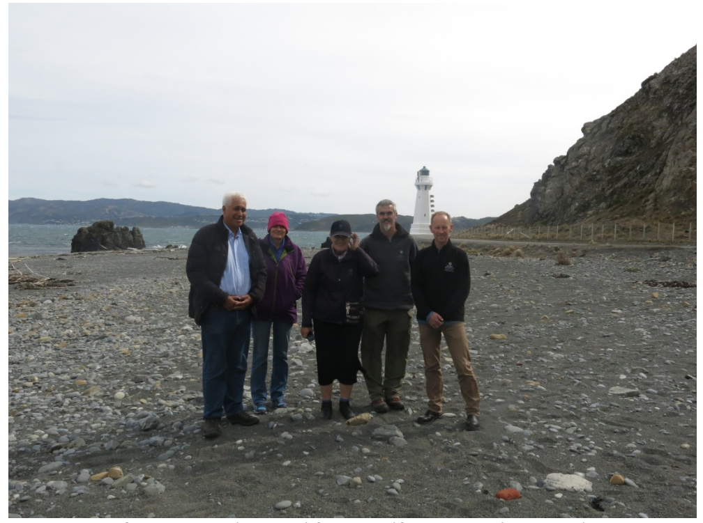
Kaumatu from Taranaki Whanui formally lifted the rāhui that was in place at Pencarrow Head to protect shore birds during their breeding season