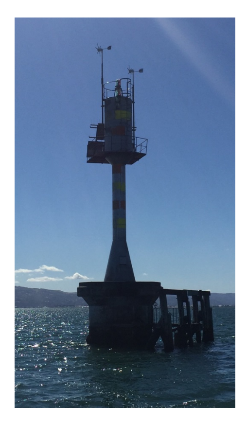
Two wind generators on Rear Leading light structure