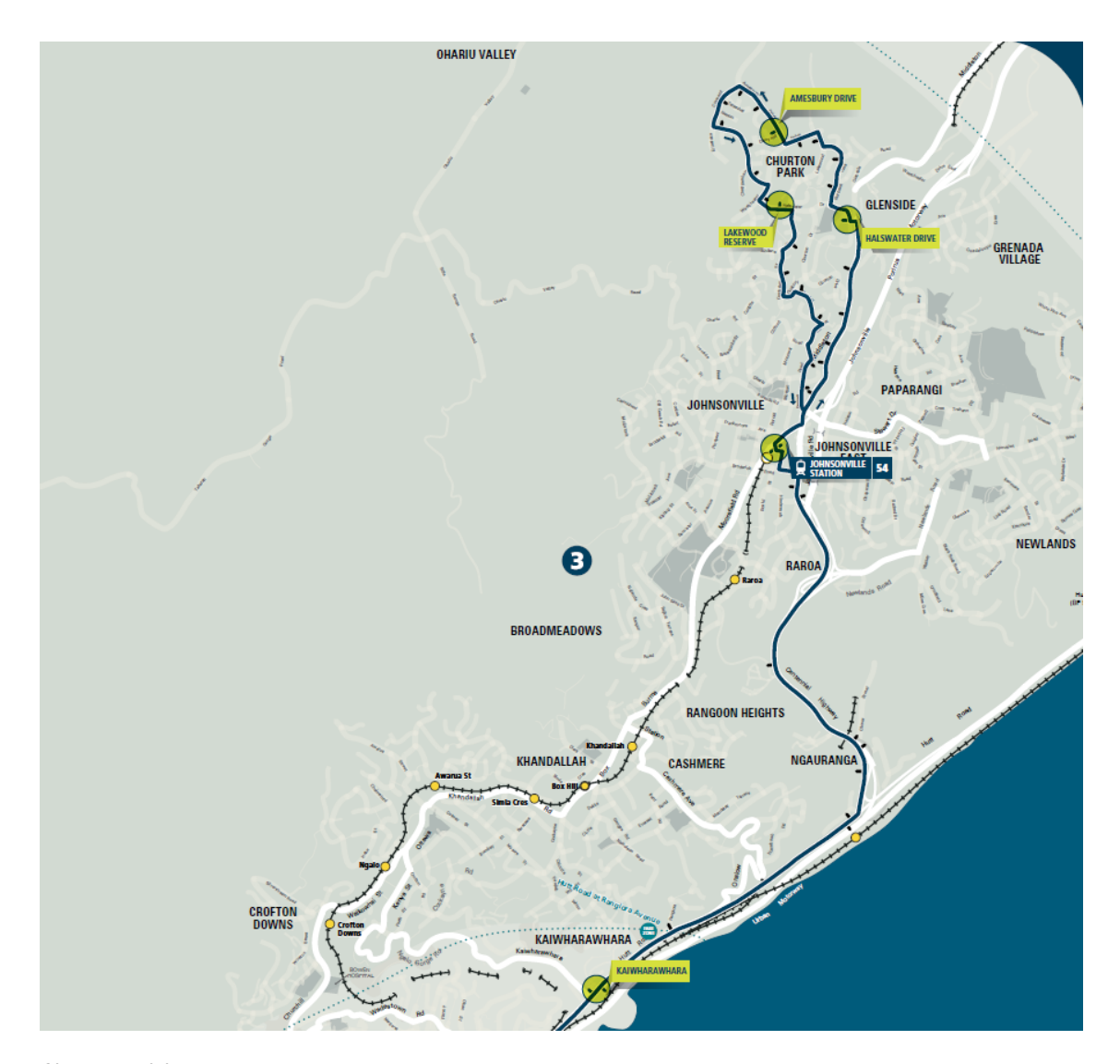
Churton Park bus route