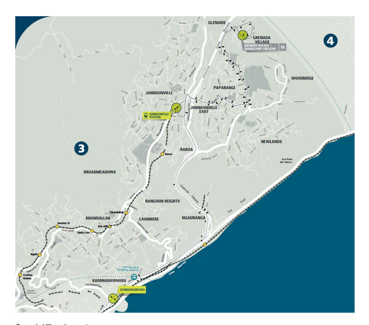
Grenada Village bus route