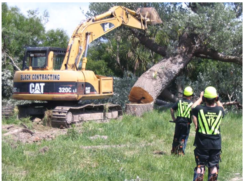
Tree Felling Training – Awaroa, November 2012