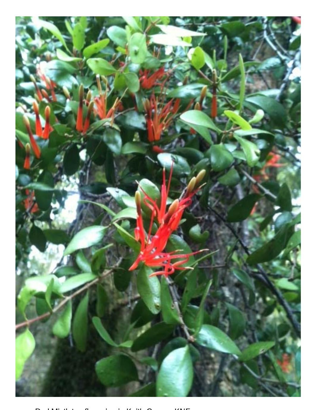
Red Mistletoe flowering in Keith George KNE