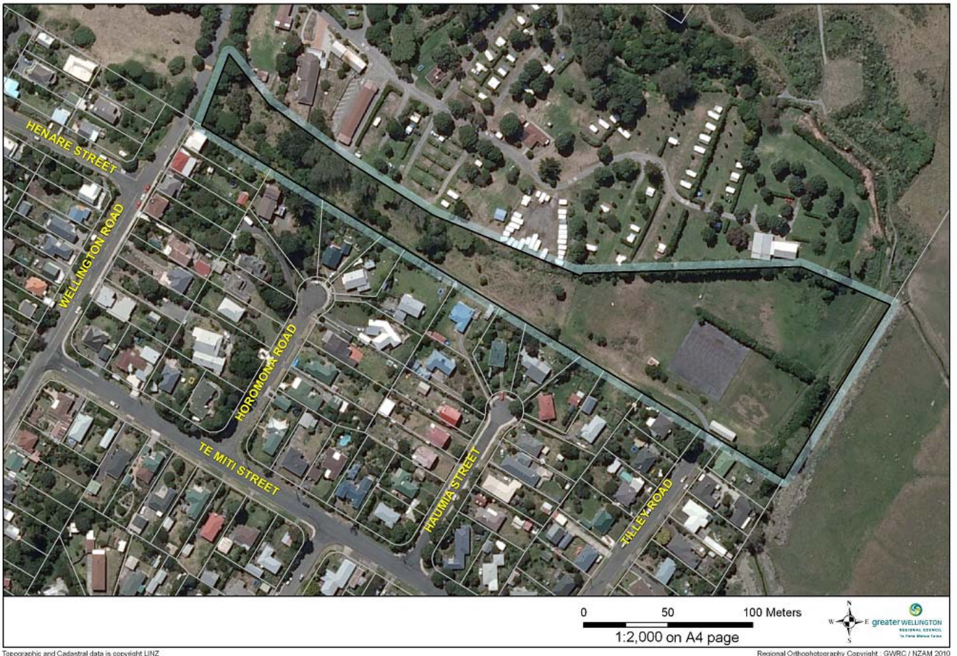
Map 1: Approximate area of Queen Elizabeth Park to be transferred

The Tilley Road area (shown in Map 1 above) is one of three entrances to Queen Elizabeth Park from the Paekakariki village. It sits between the urban area and the Paekakariki campground.