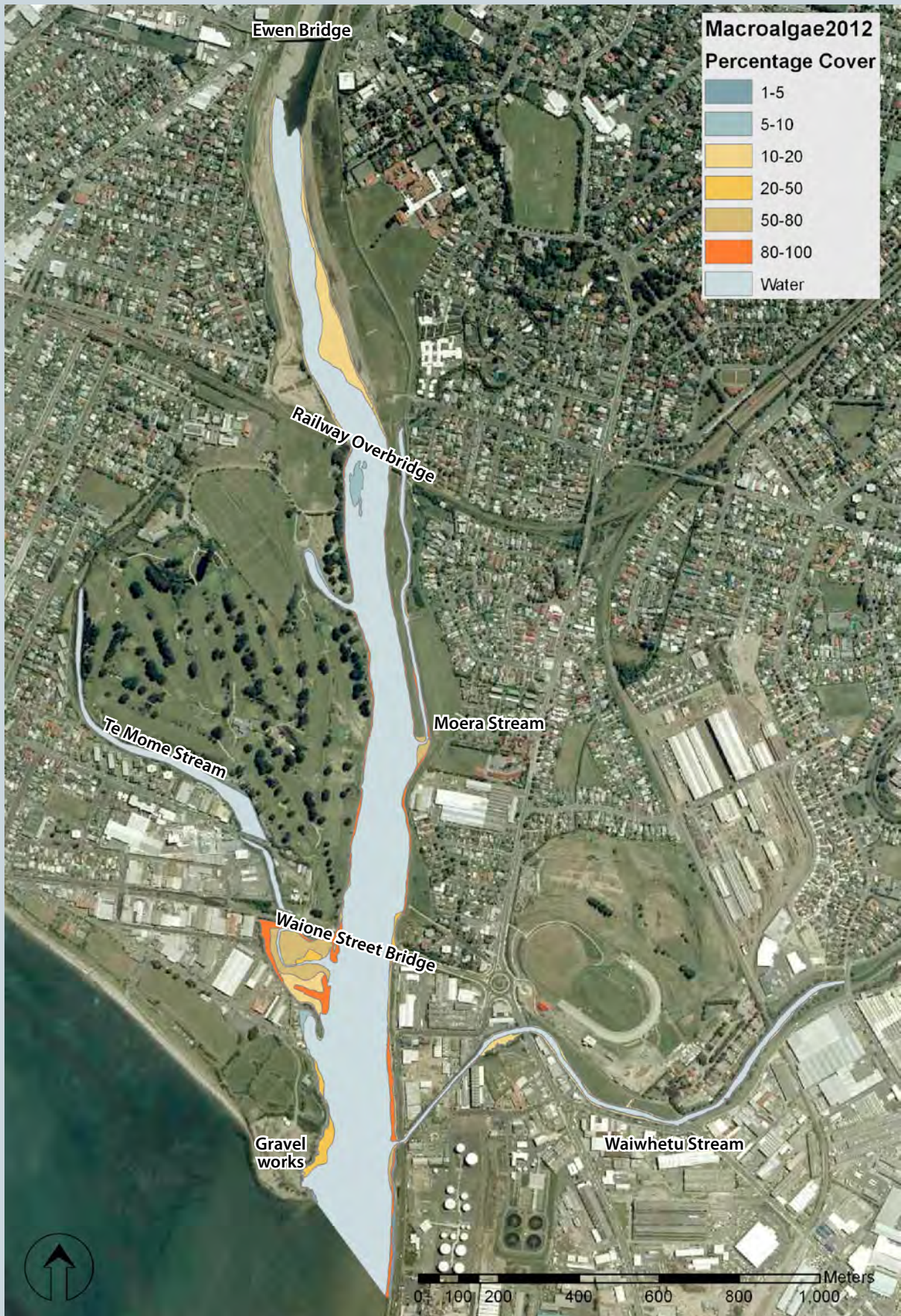
FIGURE 1. MAP OF INTERTIDAL MACROALGAL COVER - HUTT RIVER ESTUARY, FEB. 2012