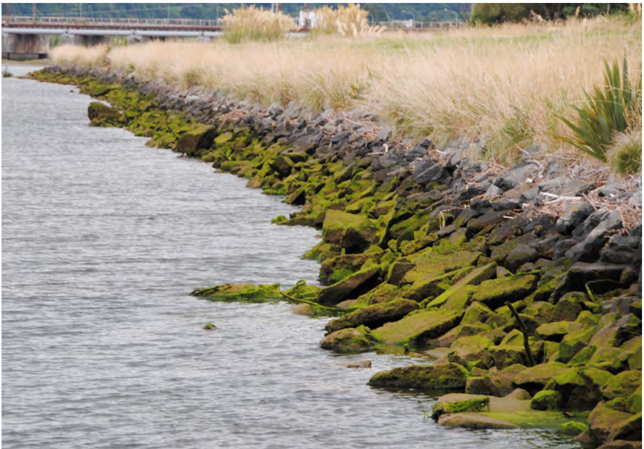
Extensive growths of Ulva intestinalis along the intertidal margins of Hutt River Estuary.