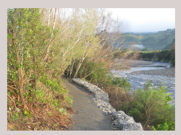
This extension to the Hutt River Trail will allow users safer access to Te Marua and the Rimutaka Rail Trail

"The gap at the end of the trail was an issue that interested parties, such as Hutt Rotary Clubs, were keen to address – but filling the gap meant going through private land," says Greater Wellington's River Ranger Thane Walls.