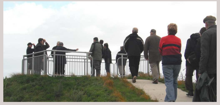
Taking in the view from Otaki Estuary's new viewing platform