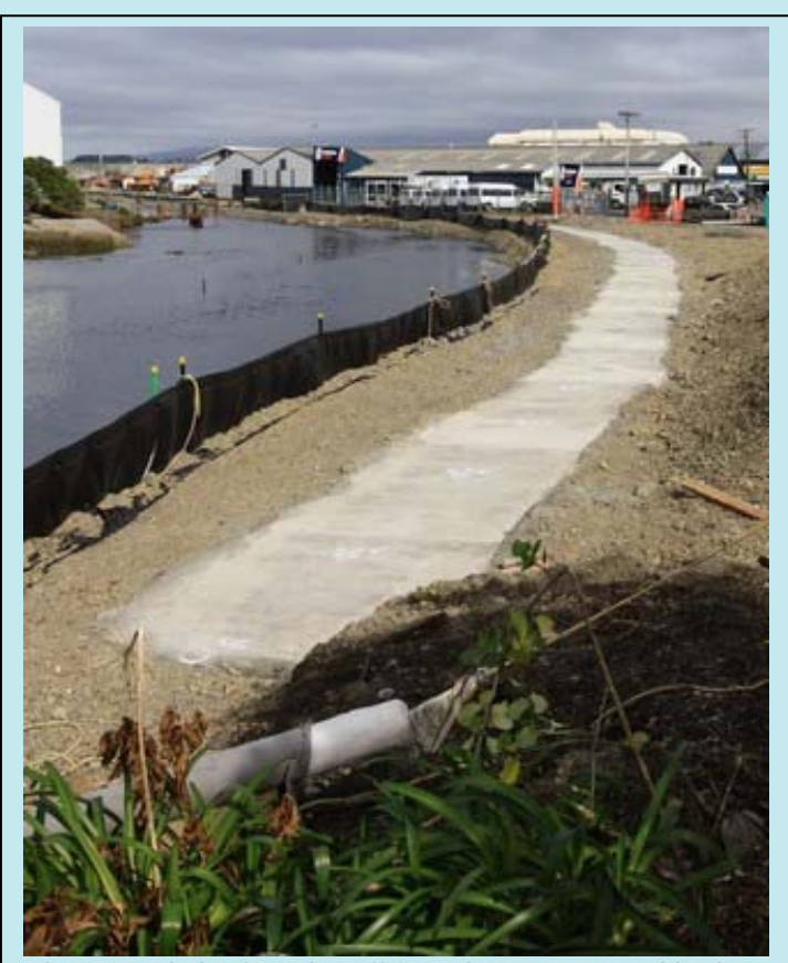
The true right bank guide wall from the Seaview Road bridge

From 1 October, when stream flow reaches its average seasonal low, clean-up works will begin from near the Bell Road bridge, working downstream. Sheet pile cells will be completed, allowing sections of the stream to be dewatered so that the contaminated sediment can be extracted.