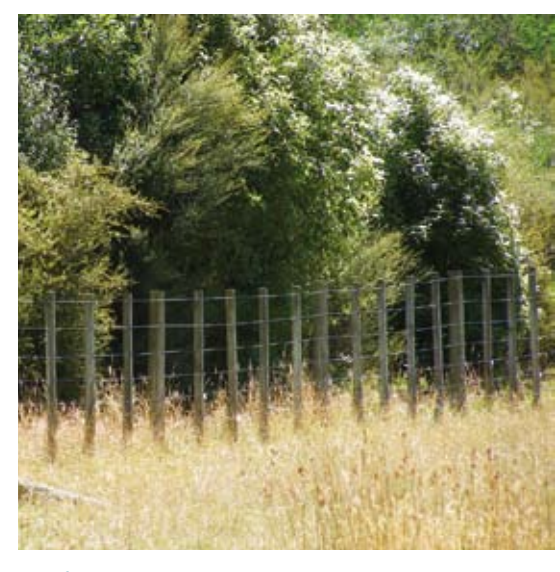
Well-fenced plantings on a stream margin

In the long term, not only will the stream be healthier and much more attractive, you will also see more native birds in the neighbourhood. The stream will have cleaner water that will be more palatable to stock. You may even find that the stream becomes a feature that adds value to your property.