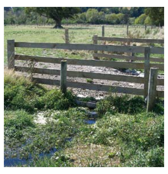
A well-fenced section of a stream