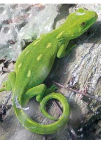
Green punctatus gecko