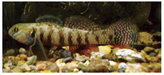
Male redfin bully