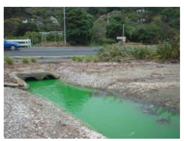
Mis-use of drain dye turns the Pauatahanui Inlet green at the foot of Postgate Drive.