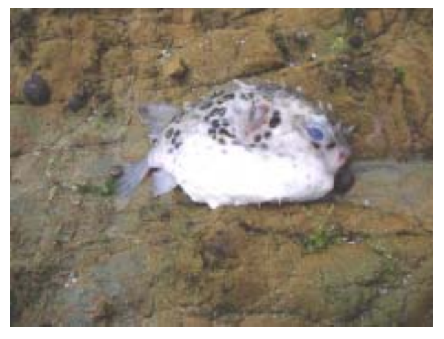
One of around 300 dead puffer fish washed up on eastern suburbs beaches in April 2004.

Taylor Preston sites (incidents associated to these sites tend to generate multiple complaints). Section 6.4 summarises the pro-active odour monitoring programme that has been implemented at these sites.