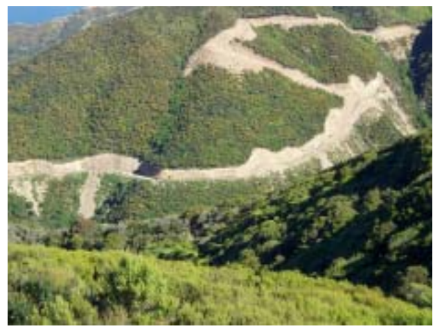
Un-consented track construction above the Carey's Gully landfill site, Wellington.

Significant increases are evident for incidents involving unconsented works (up 74%), solid waste (up 44%), silt (up 18%), dust/smoke (up 114%), vehicles (up 500%) and dead stock in watercourses (up 33%). The increases for can several categories be attributed to the introduction of pro-active our odour monitoring programme, which has freed-up officers to look for other forms of pollution in the region. However, there does appear to be a genuine