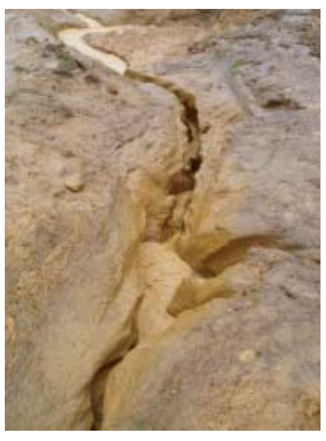
Uncontrolled site erosion by stormwater run-off at the Aotea Block subdivision site, Porirua.

A review was conducted of eight major tracks constructed on private land in the west of the region. All involved extensive vegetation clearance and earthworks, but complied with permitted activity rules in the Regional Soil Plan. Photo profiles were prepared for each track to illustrate the scale of works and associated