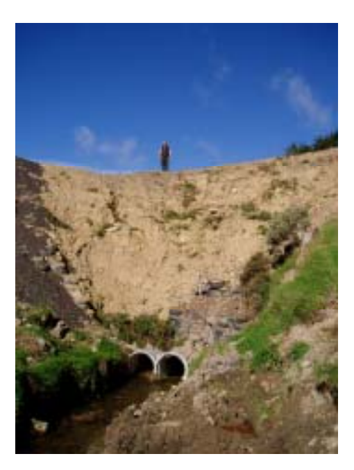
Unconsented culvert and crossing installed on the Ohariu Gorge, Wellington.