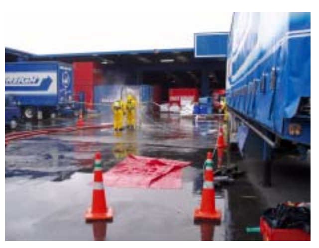
NZ Fire Service officers decontaminating equipment following a cyanide spill at Mainfreight's transport depot, Gracefield.