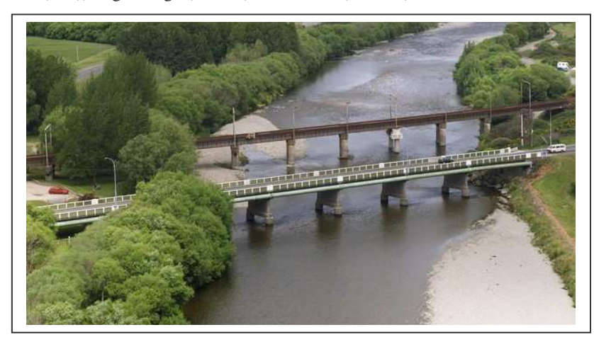
Silverstream Bridge is a key river crossing for the main (green) pipeline from Te Marua

Reservoir storage also maintains local supply when distribution pipes have to be shut off for maintenance or repair. In addition to supplying water to reservoirs owned by the four city councils, Greater Wellington operates three reservoirs within its distribution system: Haywards Hill (capacity 18 million litres (ML)), Ngauranga (20 ML) and Karori (0.6 ML)