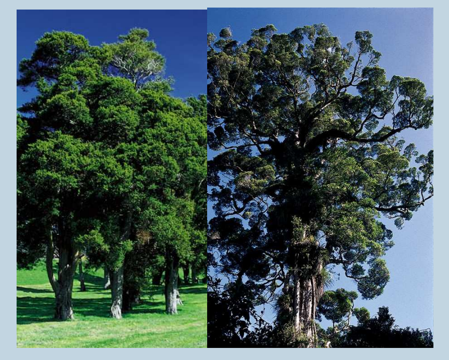
From left: "Heritage" trees of our region - totara and northern rata

Greater Wellington would like to recognise and reward some of the extraordinary work that people are doing in partnership with us to improve the health of the environment throughout the Wellington region. So this year we are launching the GW Environmental Awards. Four awards will recognise the three main groups of people that we work with to fulfil our goal of a sustainable future.