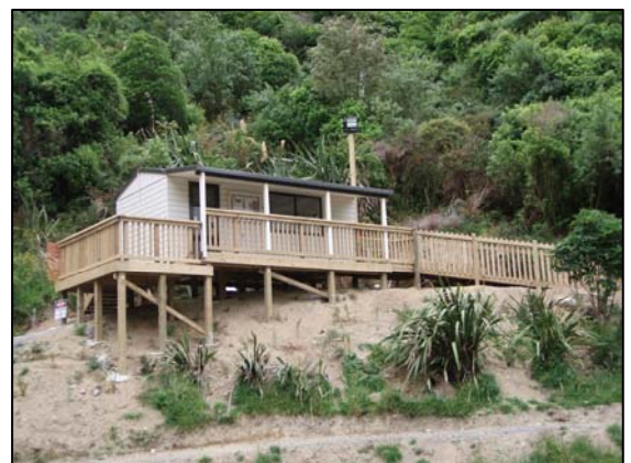
Ranger's office complete at Stratton Street entrance of the park.

General track maintenance continues with fallen trees at Takapu Road, weed spraying and new bollards installed at the Dry Creek entrance. Mowing has now been completed from Cannons Creek through to the Takapu Road track.