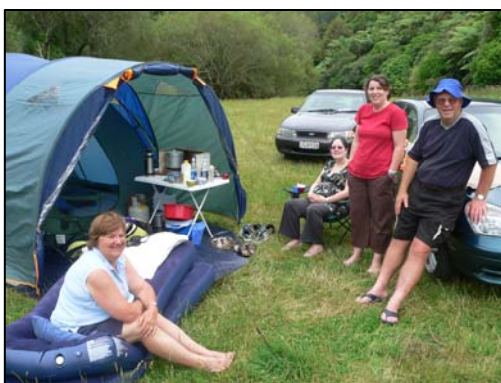
Battle Hill camping, a good meeting point for family from Wellington and New Plymouth

Staff have introduced a new recycling area to the homestead and have incorporated this by concreting an area to keep recycling bins and also making easy access to the nursery behind the workshop.