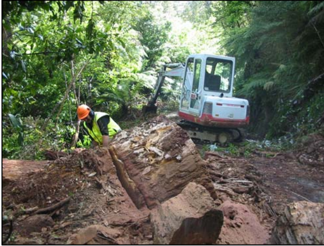
Second fallen rata tree – December 06

On the 26th November and 21 January, 2007 two Wainuiomata/Orongorongo Catchment Tours were held. The people on these tours seem to thoroughly enjoy a day to look at an excellent patch of virgin forest.