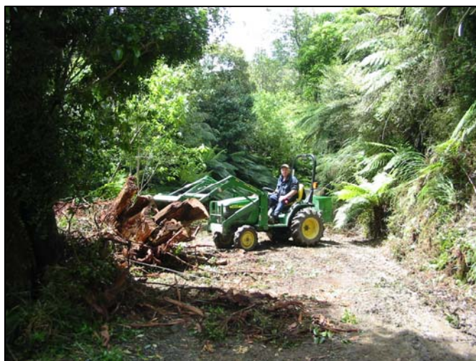
First fallen rata tree – November 06

A large Rata tree was found to be blocking the Orongorongo access road in November. With the help of Water Group staff driving a small tractor, the tree was removed from the road. A tree larger than the first blocked the road a month later. This tree required the assistance of a digger and Water Group staff. Both trees were only metres apart and fell after high wind periods. The access road is required to be open to provide access for contractors working in the Orongorongos.