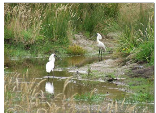
Royal Spoonbills in QEP Wetlands

The avian life at QEP this summer has been fantastic. We have had breeding Grey Teal, Dabchick, Black Swan and Pied Stilts as well as hosting Royal Spoonbills, Little and Black Shags, NZ Falcon, NZ Pipits, Shining Cuckoos, Cockatoos and the occasional Brown Teal. All this rain has been annoying for most of our human visitors but it has been a blessing for our avian visitors (as well as for those of us who like to watch the birds)!