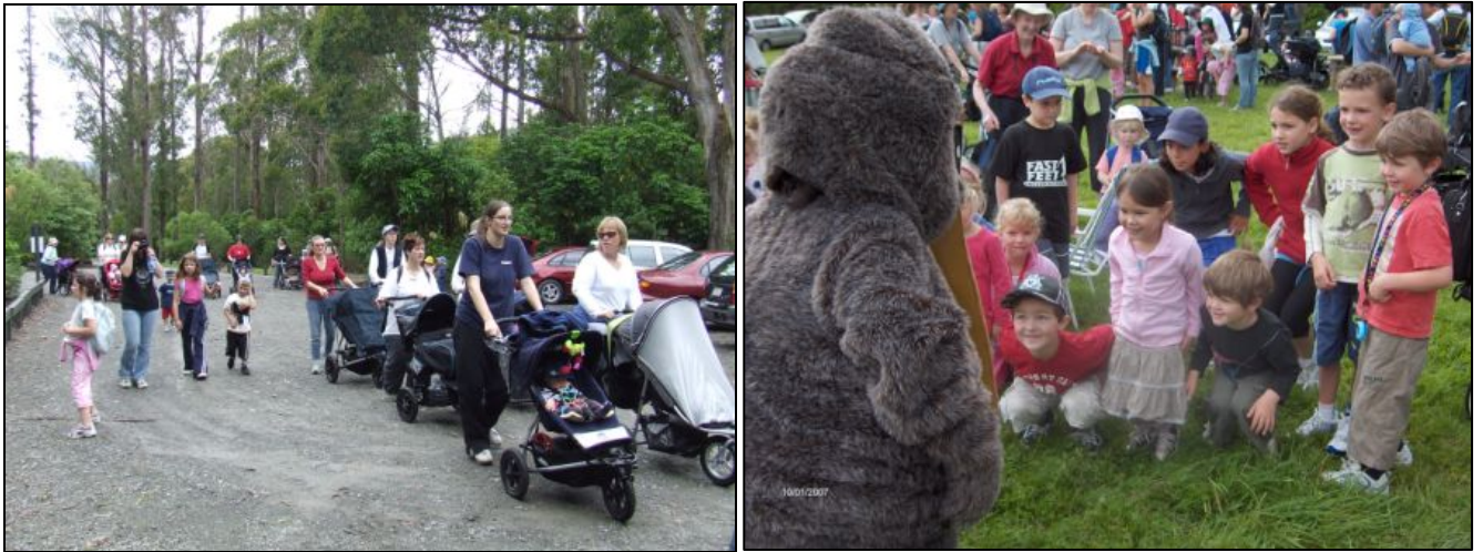
Kev Kiwi visits Tunnel Gully

We have also had two events associated with the summer programme, and these have both gone extremely well with good feedback from users.