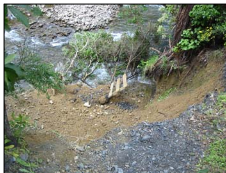
Ultimate Swimming Hole track

A large Rata tree was found to be blocking the Orongorongo access road in November. With the help of Water Group staff driving a small tractor, the tree was removed from the road. A tree larger than the first blocked the road a month later. This tree required the assistance of a digger and Water Group staff. Both trees were only metres apart and fell after high wind periods. The access road is required to be open to provide access for contractors working in the Orongorongos.