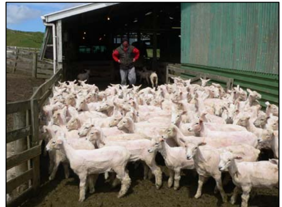
Farm activities at Waitangirua this period including lamb shearing (500 approx) and main shear of ewes (6900 approx)

Just prior to Christmas we hosted Catchment Management Division's Land Management team on a short field trip to visit Waitangirua Farm. Officers were impressed with the future potential of the farm property for promoting sustainable land management and integrated catchment management concepts.