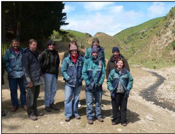
Land Management staff field trip