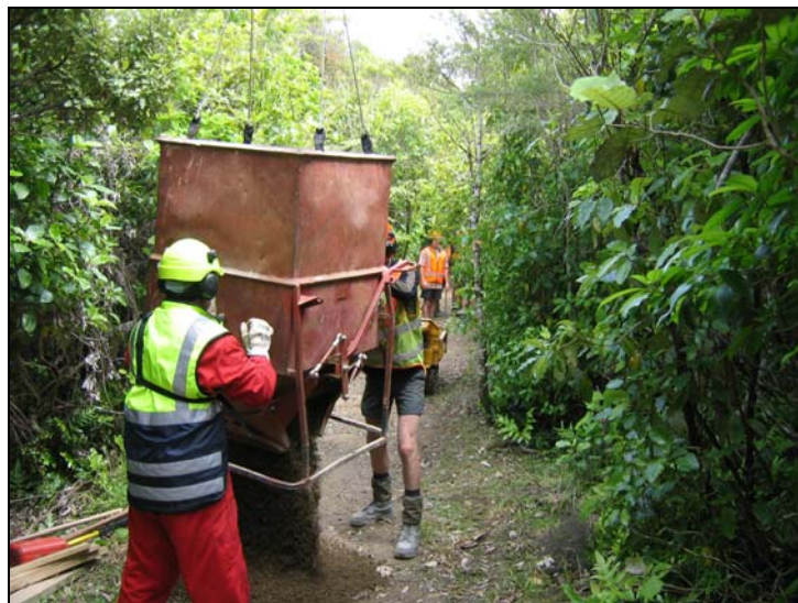
Emptying hopper on Bus Barn track

The summer events programme is going well with three of them run to date. The events at EHRP opened with an off track tramp through the Gollans Valley aimed at the fit but inexperienced. The next event featured a medium level walk along the main ridge from Wainui Hill to Days Bay while the third was a community run event featuring the work of the MIRO group and a look at the big rata trees on Hawtrey Hill above Eastbourne.