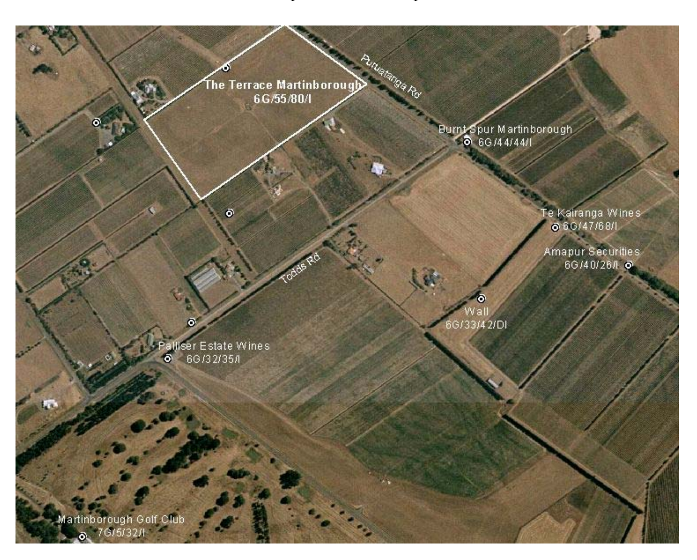
Map 1.0: Location Map

The Terrace Martinborough lodged a resource consent application (WAR 040001) to take groundwater from a bore on 5<sup>th</sup> January 2004. The application is a revised application that is updated from an original application lodged on 25<sup>th</sup> June 2003. The application is for the taking of up to 3 litres/sec, for 12 hours per day, 7 days per week, October to April inclusive, for irrigation purposes. Water is proposed to be taken from a bore close to Puruatanga Rd in Martinborough. The location of the proposed take is shown in Map 1.0.