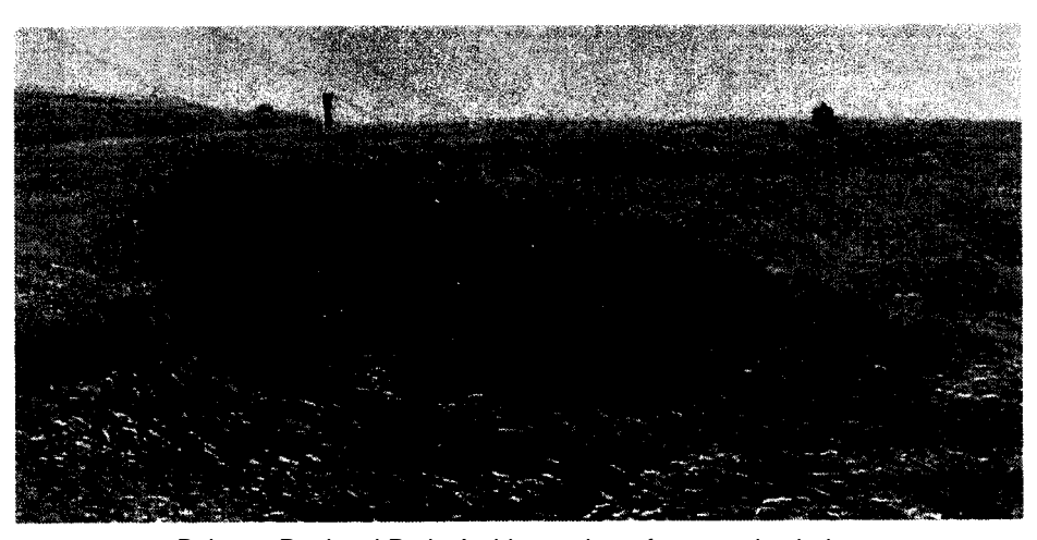
Belmont Regional Park: A side-on view of a gorse bush that has adapted itself to survive into the strong prevailing wind.