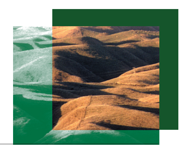
TOWARDS INTEGRATED MANAGEMENT Pauatahanui Inlet Action Plan