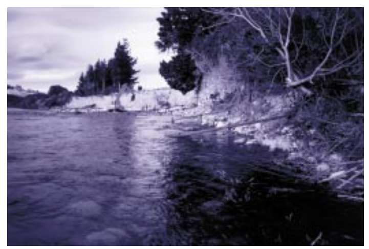
Rail groyne construction - Waingawa River

The cost of last year's works programme was $259,439 and consisted of a reprioritised original works programme, plus an additional $133,439 for repairs as a result of the September and