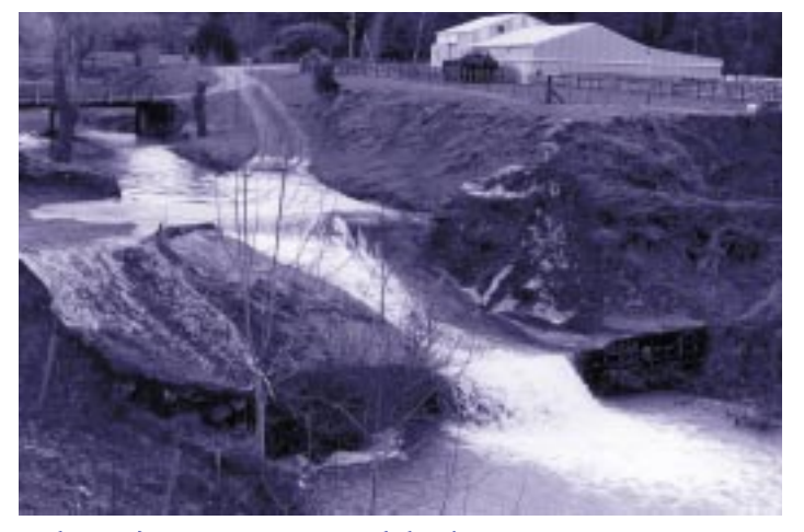
Bushgrove dropstructure – Mangapakeha River

The Advisory Committee members met recently to view two contentious areas of Scheme contribution. Specifically these were the control of gorse and other regrowth in the lower reaches of the Whareama River, and the establishment of riparian plantings in new or harvested conservation woodlots. Criteria were established on both these issues to guide future use of scheme funds