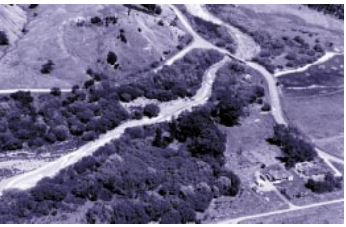
Stoney Creek Bridge at Tuturumuri

This year's budget is $32,000. The Advisory Committee approved a rate increase of 0.8 per cent.