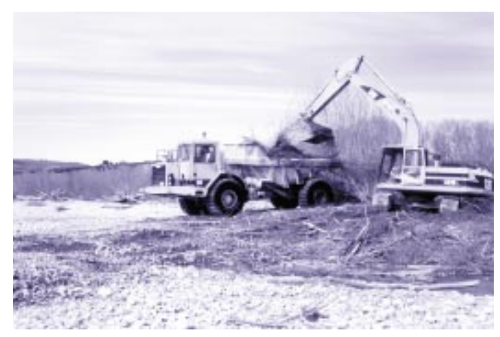
Island clearance - Ruamahanga River

are urged to take all reasonable precautions to prevent stock damage to river edge vegetation, and to report any witnessed instances of damage.