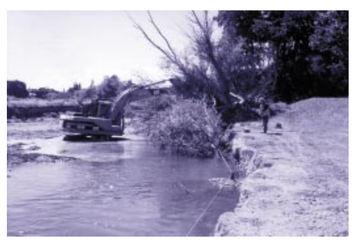
Willow cabling - Waipoua River

The advisory committee has passed a resolution "That the costs of repair of any damage to stopbanks caused by stock grazing be recovered from the person responsible". Landowners are urged to take all reasonable precautions to prevent stock damage to riverbank vegetation and stopbanks, and to report any witnessed instances of damage.