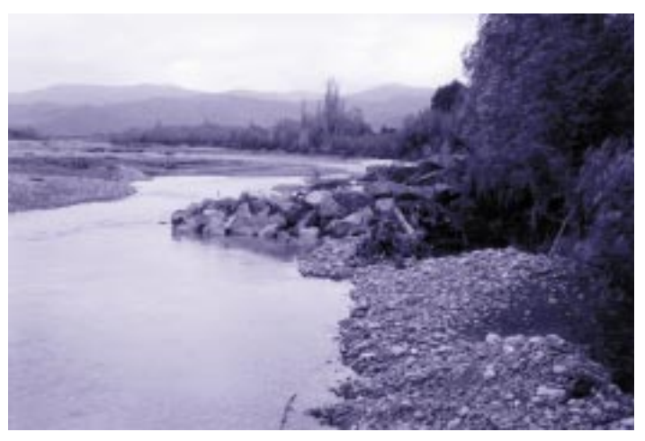
Rock groynes - Waiohine River