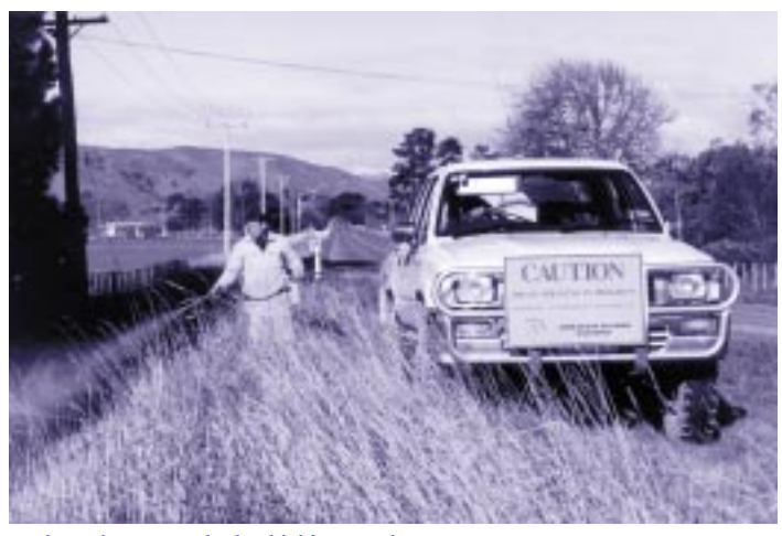
Drain maintenance by herbicide spraying