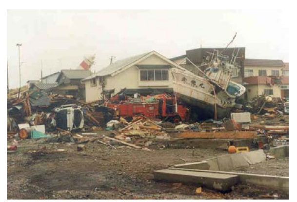
is caused by the breaking of waves on shore and the run up and wash back of water and debris. Some of the destruction caused by the 1993 tsunami which hit Okushiri Island and southwest Hokkaido, Japan on July 12, 1993, killing 120 people. The tsunami was generated by a magnitude 7.8 earthquake close to the island.

Tsunami can be generated in a number of ways including earthquakes or undersea landslides. Tsunami can be generated locally, for which there is not much warning before they strike the coast, or further afield, such as Alaska or South America. Damage is caused by the breaking of waves on shore and the run up and wash back of water and debris.