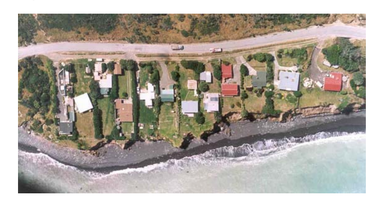
This photograph, taken in February 2000, shows houses under threat at Whatarangi. Several buildings have been lost to the sea in this area. Over 10 metres were lost between 1996 and 2001.

Much of the Wairarapa Coast is eroding. Eastern Palliser Bay has experienced several severe erosion episodes, and some places are loosing up to 1 metre per year to erosion. The Eastern Wairarapa Coast is also eroding at rates from 0.1 – 3.0 metres per year, although there is very little information for many areas of the coast. In some cases erosion provides the material for other areas of the coast, such as Riversdale, to build up.