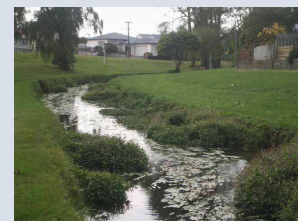
Weed growth in the Waiwhetu Stream