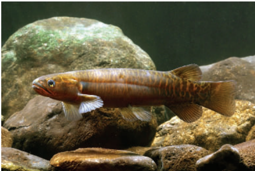
The banded kokopu is found in urban and rural streams throughout the region. The Owhiro Stream in Wellington city once had all five of the whitebait species living in it. Today, only the banded kokopu still lives there.

Fish numbers and species diversity are declining in some streams though, with urban and lowland streams most at risk.