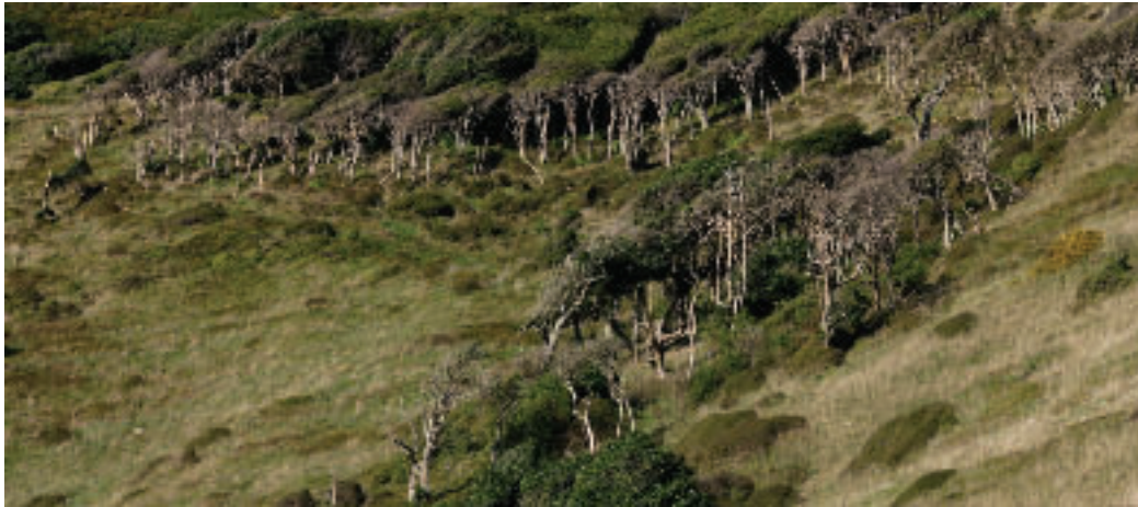
Kohekohe on the Paekakariki escarpment. The Regional Policy Statement identifies coastal escarpments and small beaches from Paekakariki to Owhiro Bay as landscapes and seascapes of regional significance. With help from Greater Wellington, most of this escarpment was legally protected in 2001, and it has since been fenced to exclude stock.