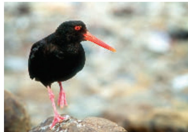
Variable oystercatchers nest on sandy and shingle beaches. This makes them and their chicks vulnerable to injury and death if vehicles are driven on the beach.

Sediments provide food and habitat for many coastal invertebrates but heavy metals can undermine their vitality. Sediment quality guidelines from the Australia New Zealand Environment and Conservation Council (ANZECC) set out tolerances for heavy metal concentrations. The survey sites comfortably met ANZECC guidelines, probably because the coarse nature of their sediment allows heavy metals to filter straight through them.