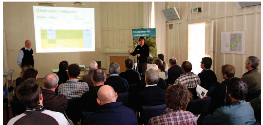
Figure 2: Water Management Workshop in Martinborough

In May 2011, a series of Wairarapa Water Management Workshops were held at five locations in the Wairarapa Valley. The purpose of the workshops was to inform water take consent holders of the outcomes of the Wairarapa Groundwater Investigations and provide advice on new government regulations for measuring and reporting water takes.