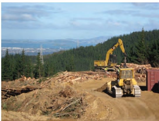
Figure 2: Compliance monitoring at a forestry site north of Wellington

Overall, the proportion of discharge permits that are rated as non-complying continued to fall in comparison to previous years, with 20% non-compliance in 2007/08 decreasing to 9% in 2010/11. This continued decrease in non-compliance is a positive reflection of more intensive monitoring of resource consents and workshops to assist consent holders, particularly in relation to earthworks sites and dairy effluent discharges. Last year Greater Wellington reported that a number of local authorities were not complying with conditions of their consents for operating wastewater treatment plants. While there has been some improvement, Greater Wellington is continuing to work closely with these consent holders to bring them up to full compliance.