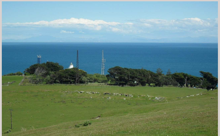
View from headland over lighthouse reserve towards South Island

Visitors are welcome to walk, run, mountain bike or picnic throughout Baring Head. There is good access to the Wainuiomata River for swimming. Beach boulders on the south coast are popular for rock climbing.