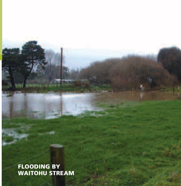
FLOODING BY WAITOHU STREAM

The Kapiti Coast District Council's District Plan includes five categories that focus on this – River Corridor, Overflow Path, Ponding, Residual Overflow, Residual Ponding and Cliff Top Erosion.