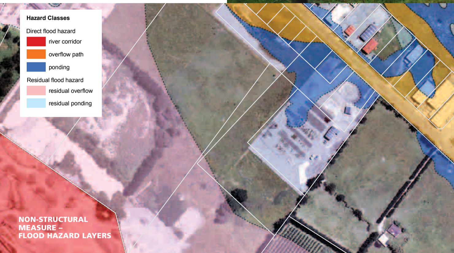
NON-STRUCTURAL MEASURE – FLOOD HAZARD LAYERS