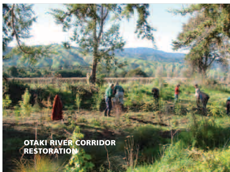
OTAKI RIVER CORRIDOR RESTORATION

The Otaki River Environmental Strategy (1999) provides a framework for enhancing the river environment from the gorge to the river mouth. The vision of this strategy involves creating a greenbelt to protect and enhance the natural character of the land next to the river. This will help provide a corridor to link the coast with the hills. This corridor will be valuable for native birds to move and plants to spread, as well as for recreation.