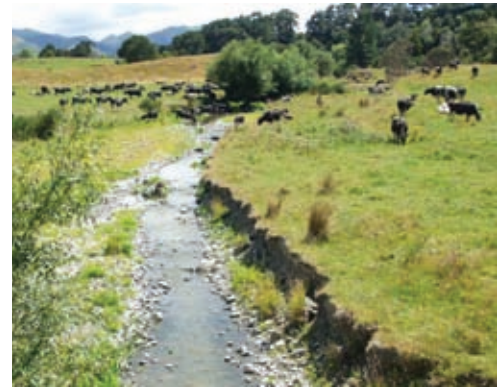
Dairy cows in the Enaki Stream