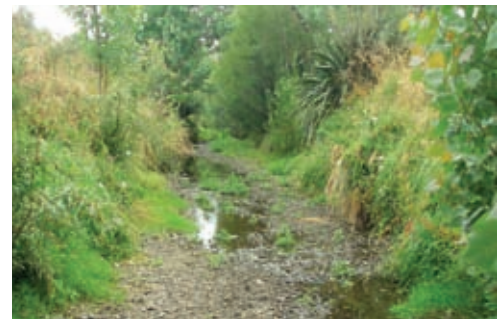
The lower reaches of the Enaki Stream reduced to a few pools in February 2009

Addressing the causes of water quality degradation highlighted by this investigation will require a cooperative effort. Greater Wellington would like to establish joint initiatives with iwi, landowners, industry groups and the wider community to address water quality issues. Options include riparian rehabilitation (already occurring and benefiting aquatic life in the lower Enaki Stream), bridged stock and vehicle stream crossings, stock exclusion from streams and deferred storage for dairyshed effluent.