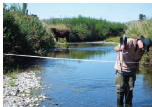
Measuring flow in the Kaipaitangata Stream, a tributary of the Mangatarere stream. Note the cattle beast in the background with access to the stream.