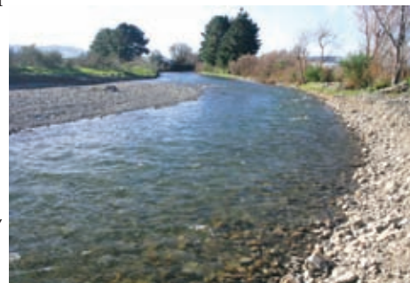
The mid reaches of the Mangatarere Stream at Andersons Line

Routine monitoring by Greater Wellington has consistently shown that nutrient concentrations in the stream are high on both a regional and national scale. Understanding the problem and causes of this poor water quality is vital before we can take steps towards improving the health of the stream.