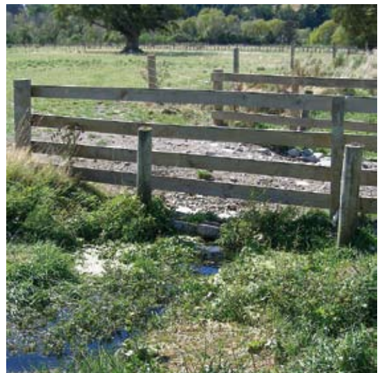
A well-fenced section of a stream