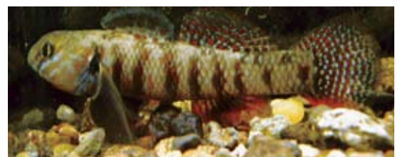
Male redfin bully