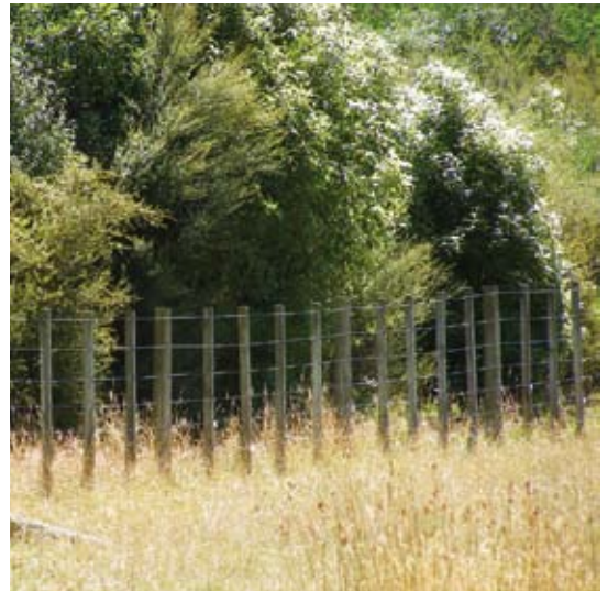
Well-fenced plantings on a stream margin

In the long term, not only will the stream be healthier and much more attractive, you will also see more native birds in the neighbourhood. The stream will have cleaner water that will be more palatable to stock. You may even find that the stream becomes a feature that adds value to your property.