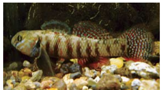
Male redfin bully