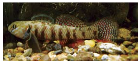
Male redbfin bully