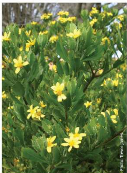
Boneseed ( Chrysanthemoides monilifera ssp. monilifera )

Here's an example of the type of work you would be engaged in.