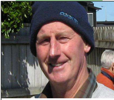
Our new Chairman