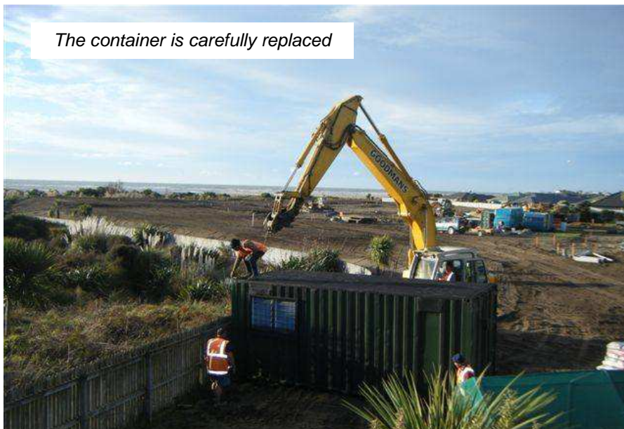
The container is carefully replaced

'No trouble' said the boss, 'we have the gear and the muscle!' Indeed they had, in no time a couple of strops were thrown over the container and it was lifted with ease, out of the way. The potting mix was thrown into the bucket of a front end loader and that disappeared for two or three weeks, the shade house was lifted by four people and walked out of the battle zone. (See story above). Trenches dug pipes laid, ground levelled and everything was put back