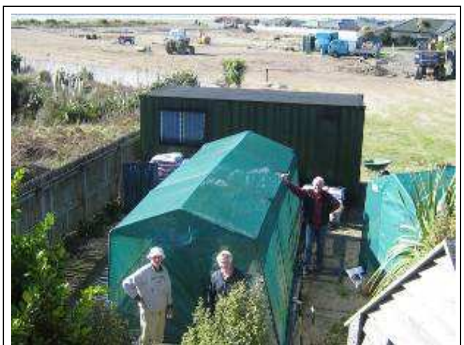
The replacement shade house in place