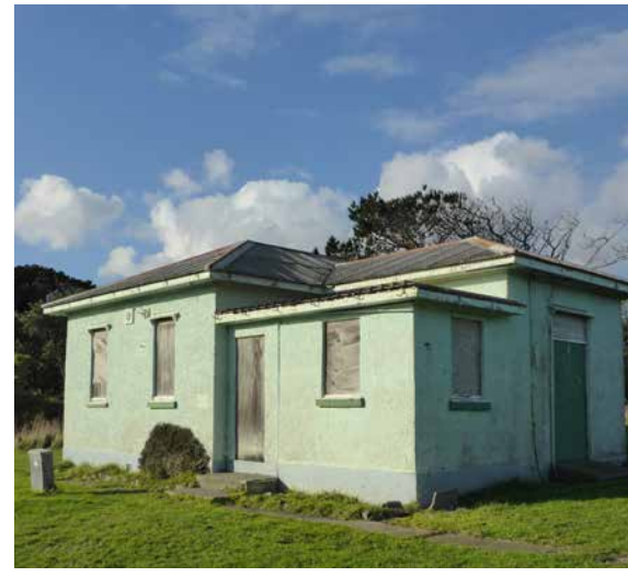
Power House now