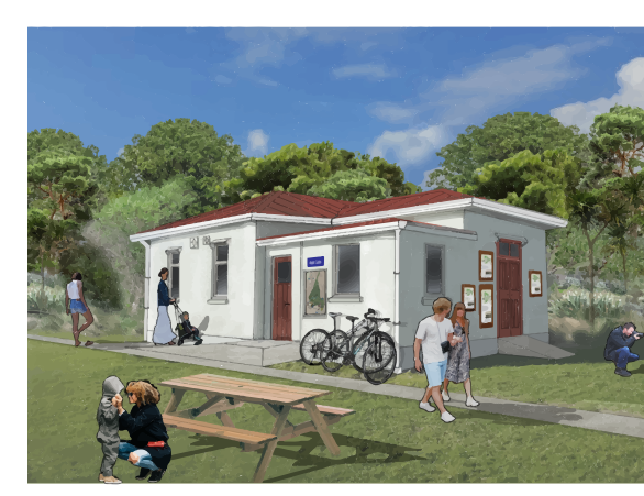
Vision for the Power House as a visitor centre revealing stories of Baring Head/ Orua-puanui