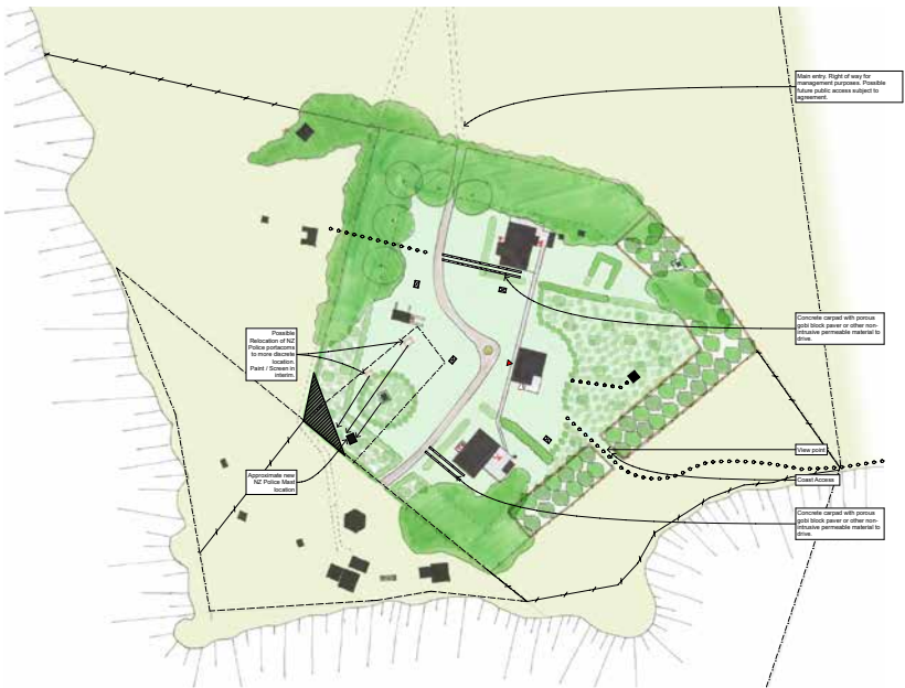
Overall lightkeeper's complex restoration plan