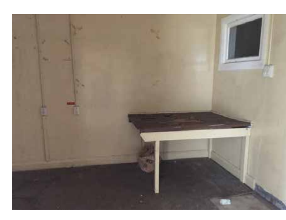
Power House now